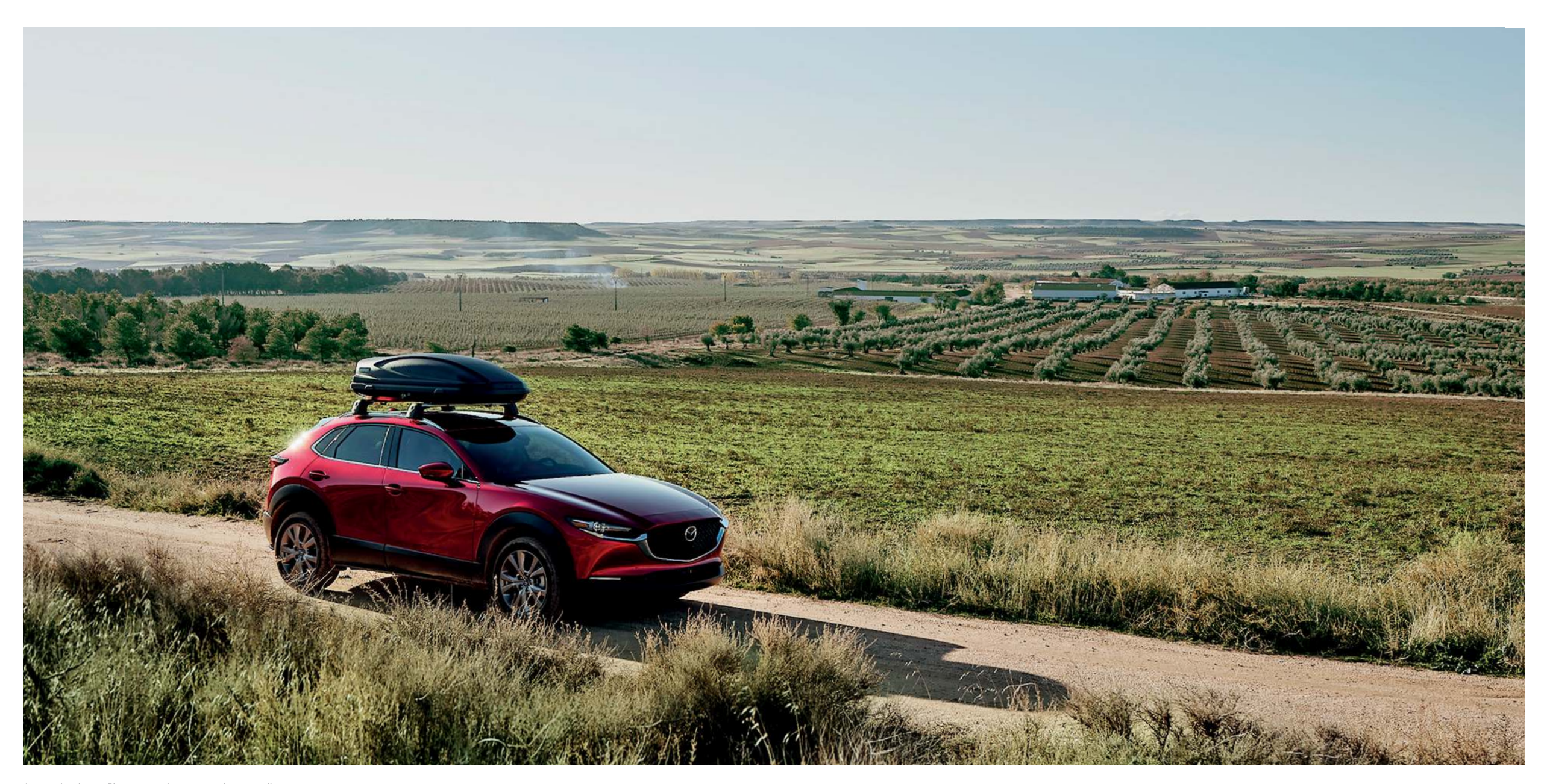
Accessories shown. Please remember to properly secure all cargo.