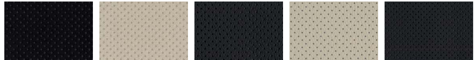
Graphite Cloth S|SV Cashmere Cloth SV Graphite Leatherette SV Cashmere Leatherette SV Graphite Leather 4 SL