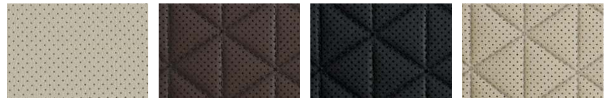
Cashmere Leather 4 SL Mocha Semi-aniline Leather 4 Platinum Graphite Semi-aniline Leather 4 Platinum Cashmere Semi-aniline Leather 4 Platinum