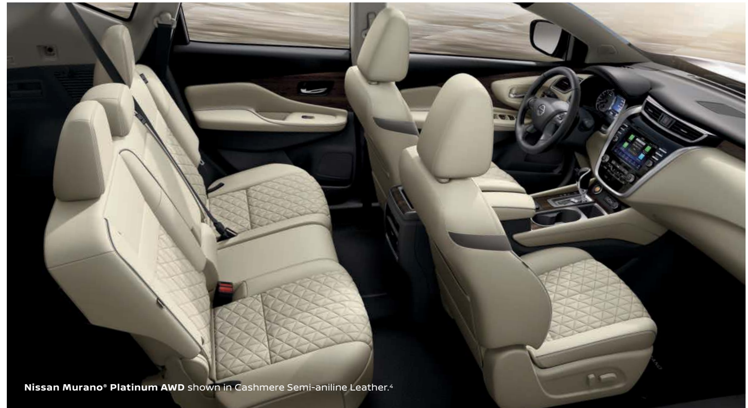
Nissan Murano ® Platinum AWD shown in Cashmere Semi-aniline Leather. 4