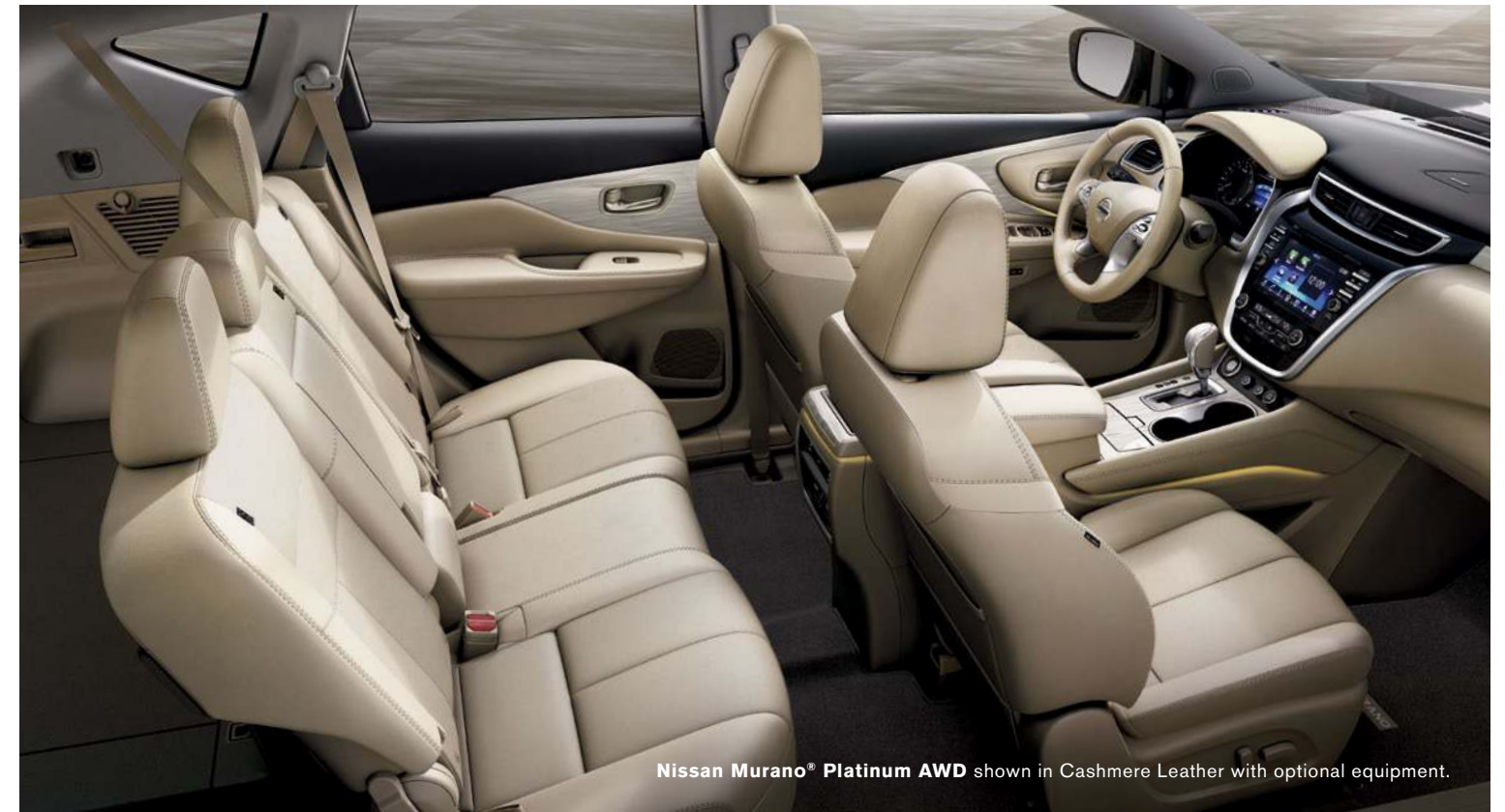
Nissan Murano® Platinum AWD shown in Cashmere Leather with optional equipment.