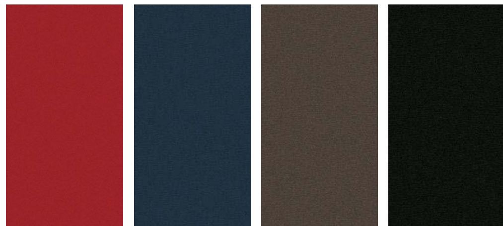
Cayenne Red NAH