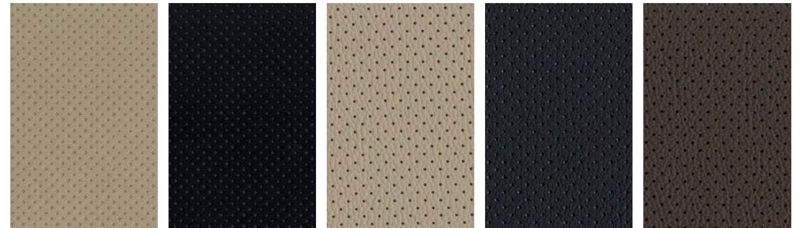
Cashmere Cloth S | SV