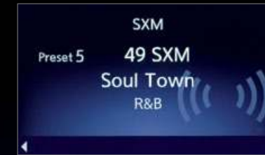
SIRIUSXM® AUDIO 7