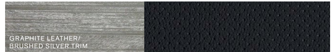
GRAPHITE LEATHER/ BRUSHED SILVER TRIM