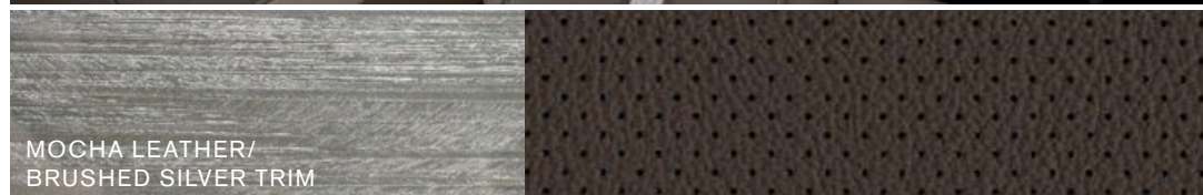
MOCHA LEATHER/ BRUSHED SILVER TRIM