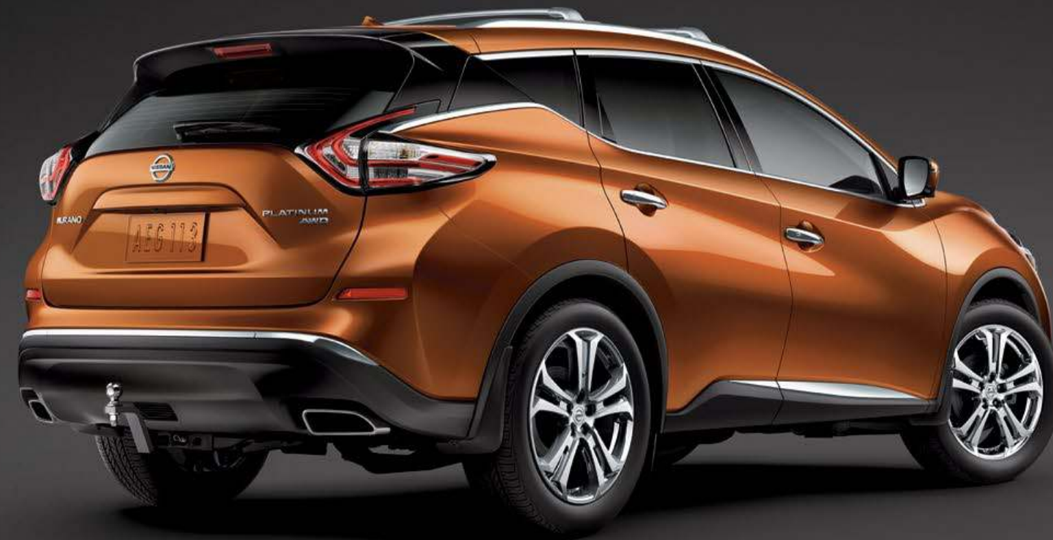
Nissan Murano ® Platinum shown in Pacific Sunset with 20" Aluminum-alloy Wheels, 5 Roof Rail Crossbars, Splash Guards, Tow Hitch Receiver, Hitch Ball Mount, and Hitch Ball.

For more information and to shop online for Murano ® Genuine Nissan Accessories, go to bit.ly/murano_estore