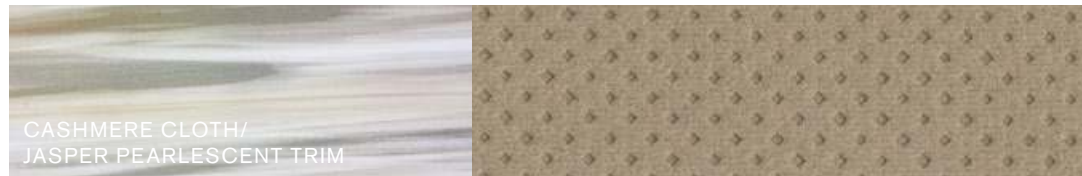
CASHMERE CLOTH/ JASPER PEARLESCENT TRIM