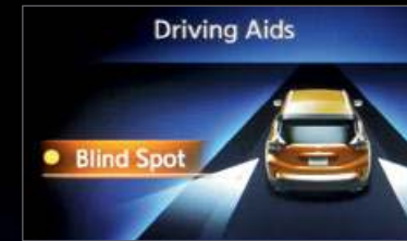
DRIVING AIDS 6