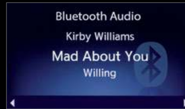
WHAT'S PLAYING 4

Daily commutes, traffic jams and lattes. With all you've got going on, you can still focus on what's most important: driving. You can see all the info you need on a 7" color display for your eyes only. From turn-by-turn directions to caller ID or safety features, the Advanced Drive-Assist® Display lays it all right before your eyes — helping to minimize time looking away. 1,2,3