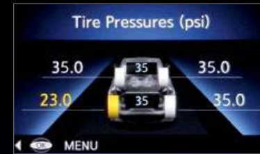
TIRE PRESSURE MONITORING SYSTEM 5