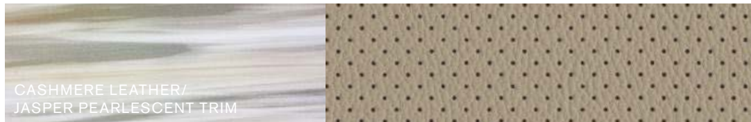
CASHMERE LEATHER/ JASPER PEARLESCENT TRIM