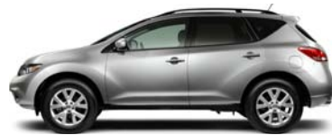
SV: PICTURE OF VERSATILITY