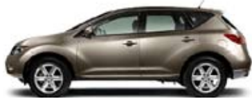
S: REDEFINITION OF ADVENTURE