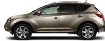
SL: WITH 360° VALUE PACKAGE