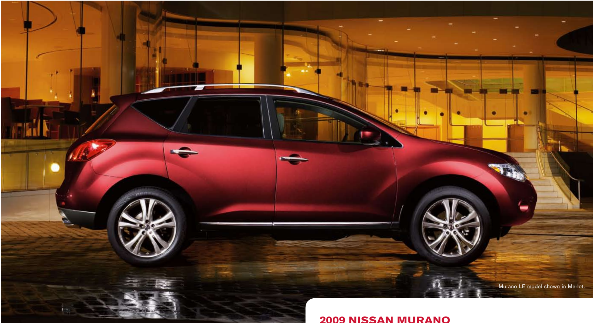
Murano LE model shown in Merlot.