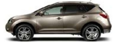
LE: PORTRAIT OF LUXURY