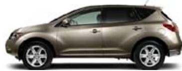
SL: STATEMENT OF BEAUTY