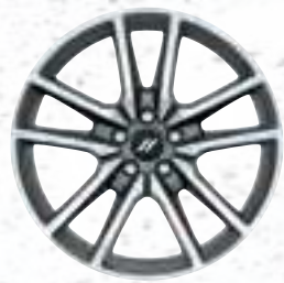
20 by 8-inch Tinted Polish with Granite Pockets Included with Plus Group on R/T (WHH)