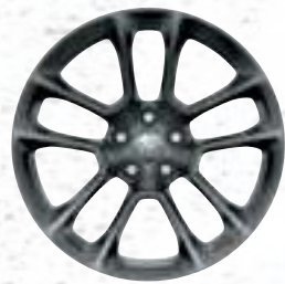
20 by 9-inch Low-Gloss Granite Crystal Standard on Scat Pack (WRP)