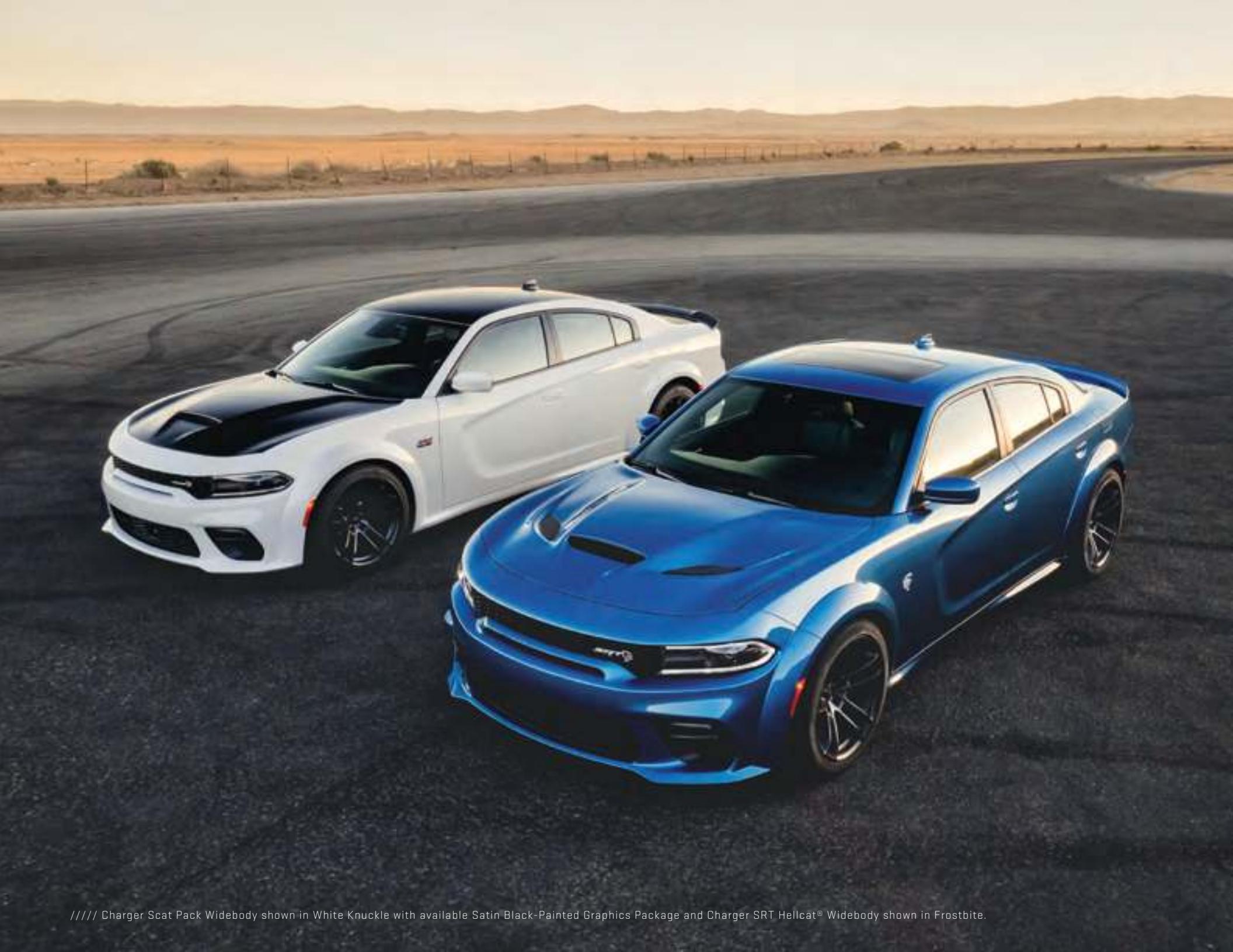
////// Charger Scat Pack Widebody shown in White Knuckle with available Satin Black-Painted Graphics Package and Charger SRT Hellcat® Widebody shown in Frostbite.