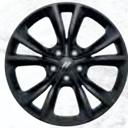
19 by 7.5-inch Black Noise Included with Blacktop Package on SXT AWD (WP4)