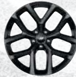
20 by 8-inch Black Noise Included with Blacktop Package on SXT, GT and R/T (WRE)