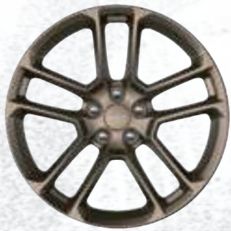
20 by 9.5-inch Brass Monkey Lightweight Forged Optional on Scat Pack (WRJ)