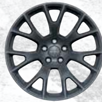
20 by 11-inch Warp-Speed Granite Optional on SRT Hellcat (WS5)