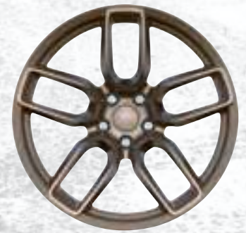
20 by 11-inch Brass Monkey Widebody Forged Optional on SRT Hellcat Widebody (WDF)