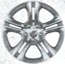
17-inch Fine Silver Standard on SXT (WAE)