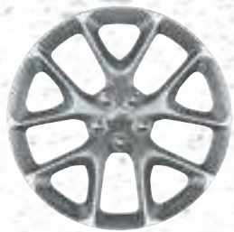
20 by 8-inch Satin Carbon Standard on GT; Included with Plus Group on SXT (WPZ)