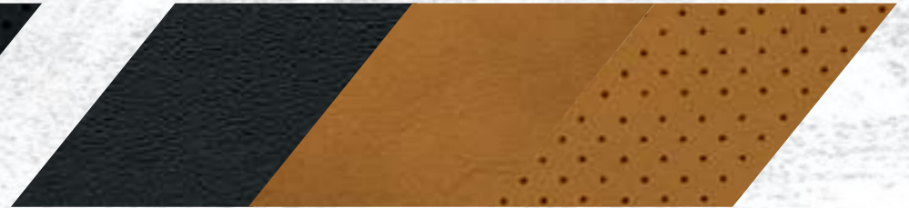
NAPPA LEATHER TRIM WITH NAPPA LEATHER-TRIM PERFORATED INSERTS AND TUNGSTEN ACCENT STITCHING – BLACK AND CARAMEL. OPTIONAL WITH PLUS GROUP ON SXT RWD AND SXT AWD