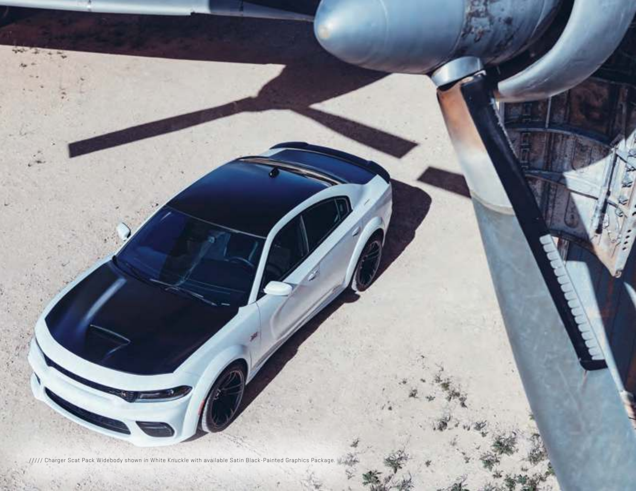
////// Charger Scat Pack Widebody shown in White Knuckle with available Satin Black-Painted Graphics Package.