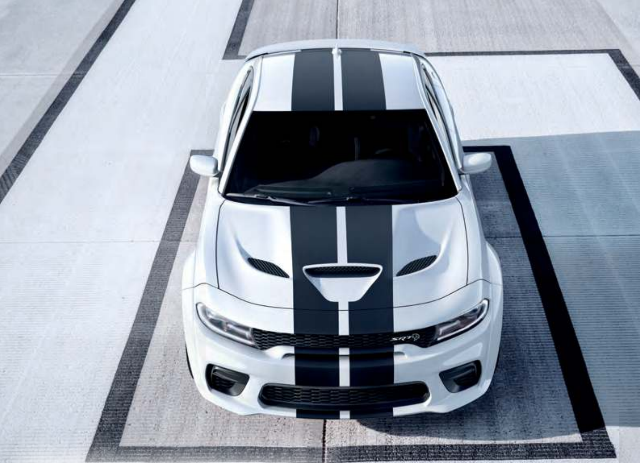
///// Charger SRT Hellcat® Widebody shown in White Knuckle with available dual stripes in Carbon.