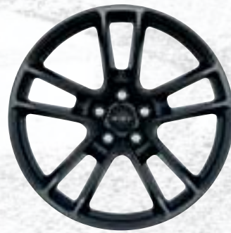
20 by 11-inch Carbon Black Standard on SRT Hellcat®; Optional on Scat Pack Widebody (WSG)