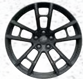
20 by 9.5-inch Low-Gloss Black Forged Standard on Daytona 392; Included with Dynamics Package on Scat Pack (WRV)