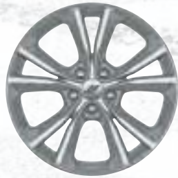
19 by 7.5-inch Satin Carbon Standard on SXT AWD (WRQ)