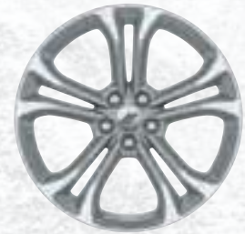
20 by 8-inch Satin Carbon Standard on R/T; Included with Plus Group on GT (WHK)