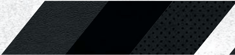
NAPPA LEATHER TRIM WITH NAPPA LEATHER-TRIM PERFORATED INSERTS AND TUNGSTEN ACCENT STITCHING – BLACK. INCLUDED WITH PLUS GROUP ON SXT RWD AND SXT AWD