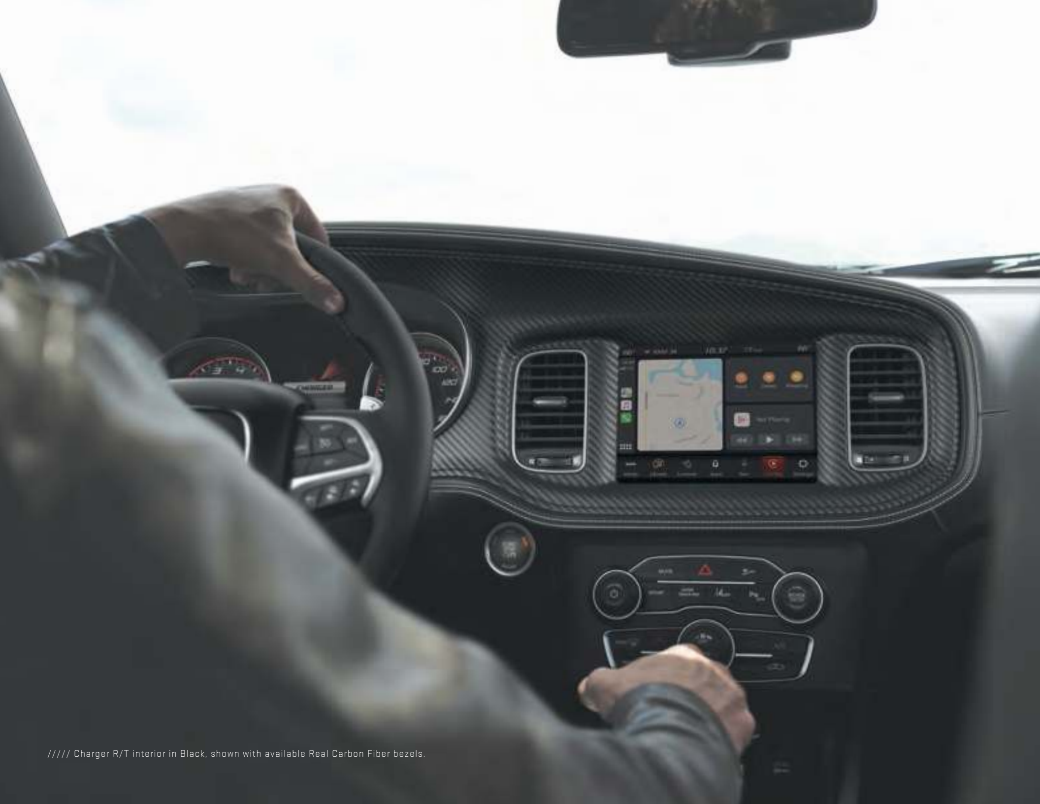
///// Charger R/T interior in Black, shown with available Real Carbon Fiber bezels.