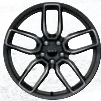
20 by 11-inch Devil's Rim Standard on Scat Pack Widebody (WSC)