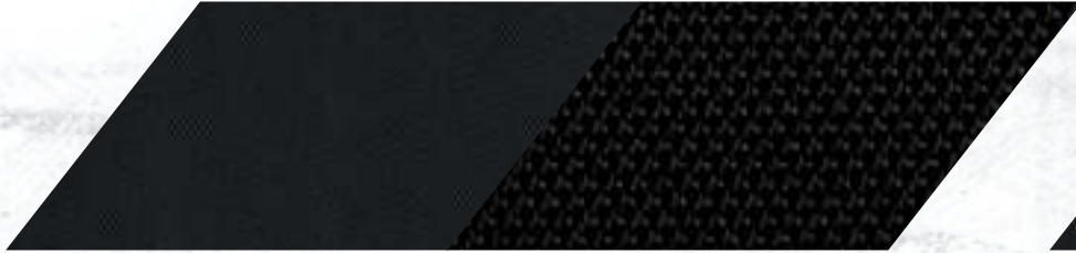
SEDOSO / TORQUE SPORT CLOTH WITH TUNGSTEN ACCENT STITCHING – BLACK. STANDARD ON SXT RWD AND SXT AWD