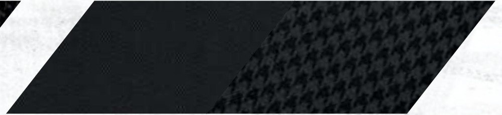
SEDOSO / HOUNDSTOOTH PREMIUM CLOTH – BLACK. OPTIONAL ON SXT RWD AND SXT AWD