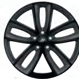
20 by 9-inch Lights Out Included with Performance Handling Group on GT and R/T; Included with Daytona Edition on R/T (WHF)