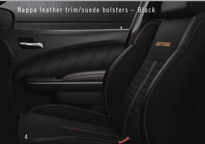
Nappa leather trim/suede bolsters – Black