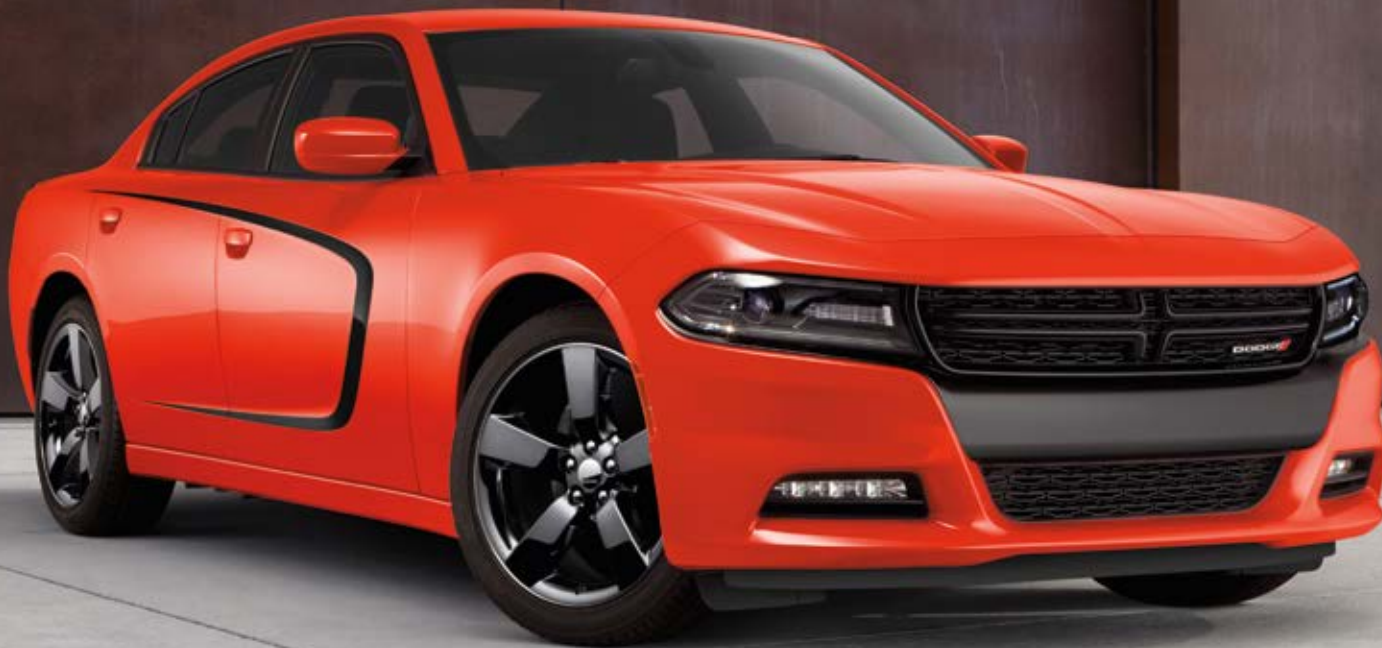
///// Dodge Charger SXT shown with Authentic Dodge Accessories by Mopar®: Matte Black Bodyside Graphic and 20-Inch Black Chrome Wheels.