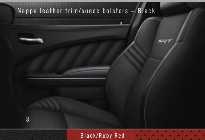
Nappa leather trim/suede bolsters – Black