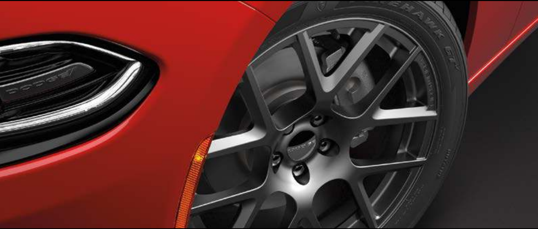
20x9-INCH FORGED ALUMINUM WHEELS //