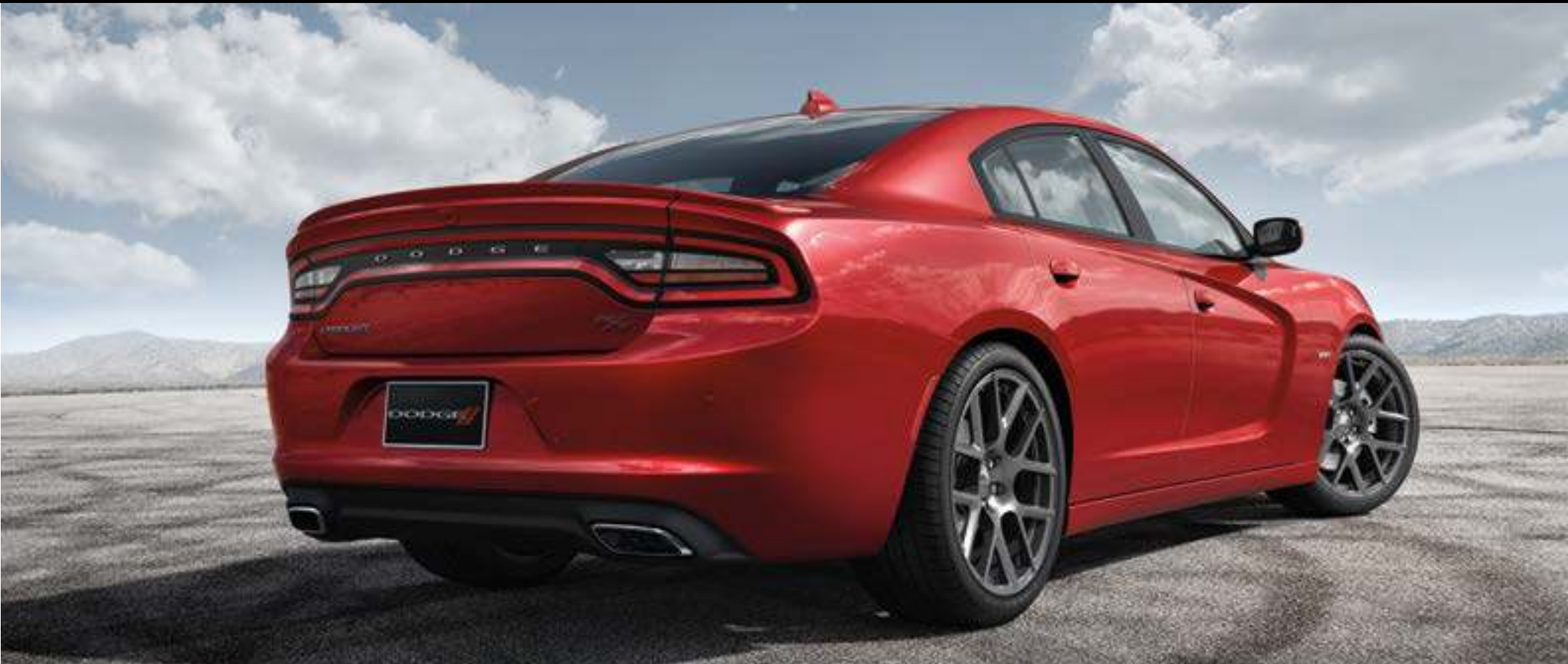
CHARGER R/T ROAD & TRACK IN REDLINE RED //