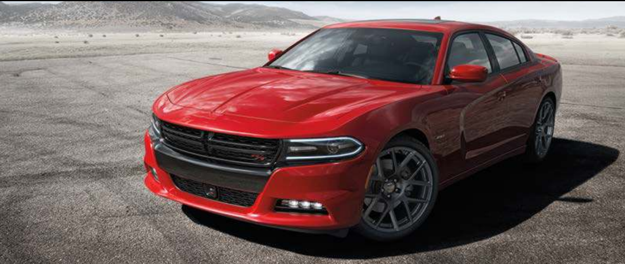
CHARGER R/T ROAD & TRACK IN REDLINE RED // // // //