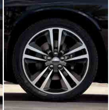
20-inch cast aluminum with Black pockets (standard on SRT® Super Bee)