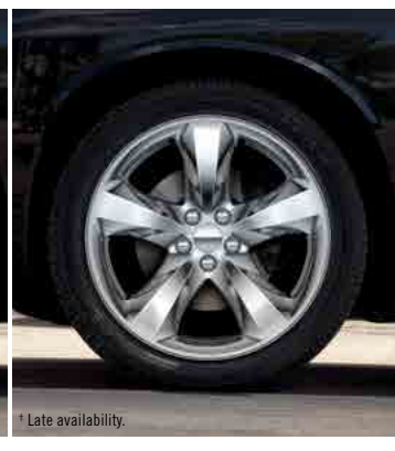
20-inch chrome-clad aluminum (standard on R/T Max and R/T Road & Track, included in Rallye Appearance Group on SXT and SXT Plus, in Wheels and Tunes Group on R/T and R/T Plus and 20-inch Wheel Sport Appearance† on SXT and SXT Plus)