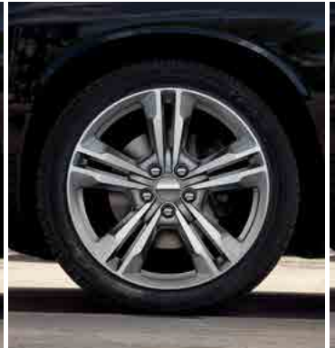
19-inch Satin Carbon aluminum (standard on all-wheel-drive [AWD] models)