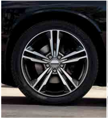
19-inch polished aluminum with Gloss Black Pockets (included in AWD Sport Appearance Package on SXT, SXT Plus, R/T and R/T Plus)