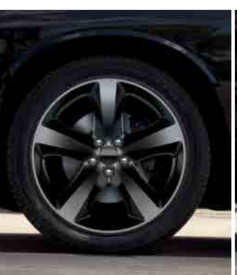
20-inch Gloss Black aluminum (included in Blacktop Package on SXT, SXT Plus, R/T and R/T Plus)