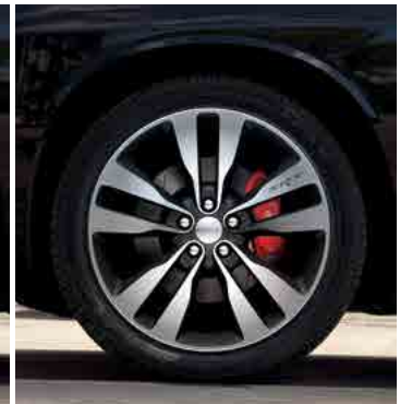
20-inch forged aluminum with polished face and Black pockets (standard on SRT)