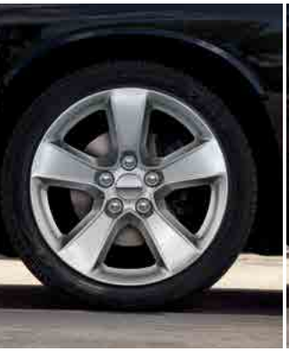
17-inch aluminum (standard on SE and SXT)