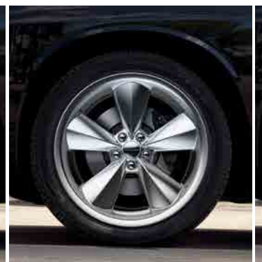
20-inch Classic II polished forged aluminum (optional on R/T Road & Track and Rallye Appearance Group on SXT and SXT Plus)