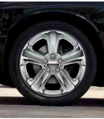
18-inch chrome-clad aluminum (standard on SXT Plus and R/T Plus, included in Sport Appearance Group on SE and SXT)