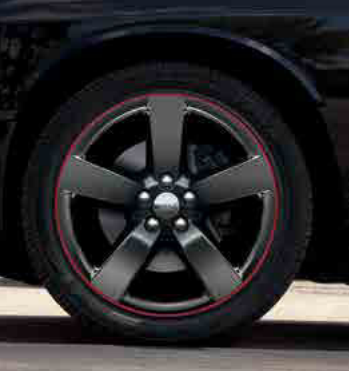
20-inch Black Chrome aluminum with Red lip/backbone (included in Redline Package on SXT and SXT Plus)