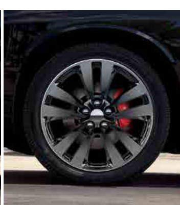
20-inch Black Vapor Chrome forged aluminum (optional on SRT)