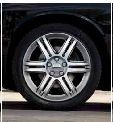
18-inch polished aluminum (standard on R/T, optional on SXT)