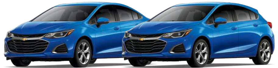
KINETIC BLUE METALLIC 1,2