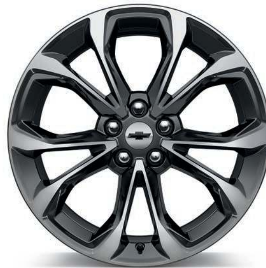
18" Machined-Face Aluminum (Included with RS Package on Diesel Hatchback and Premier)