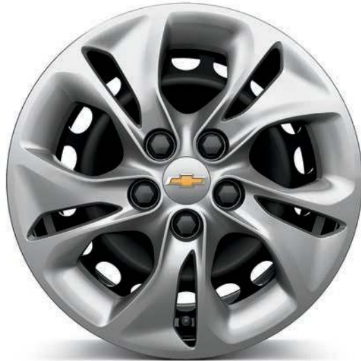
15" Steel with Painted Wheel Cover (Standard on L and LS)