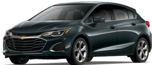
NIGHTFALL GRAY METALLIC 4,5