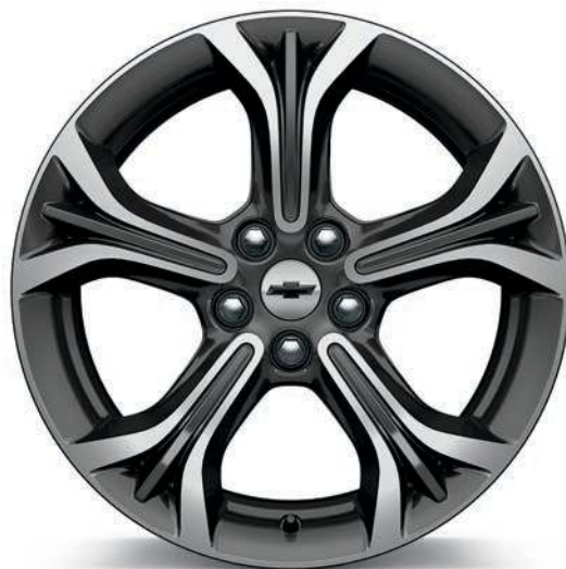
17" Aluminum (Included with RS Package on LT)