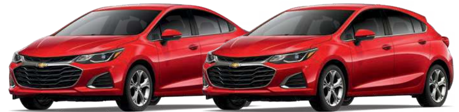
RED HOT 5