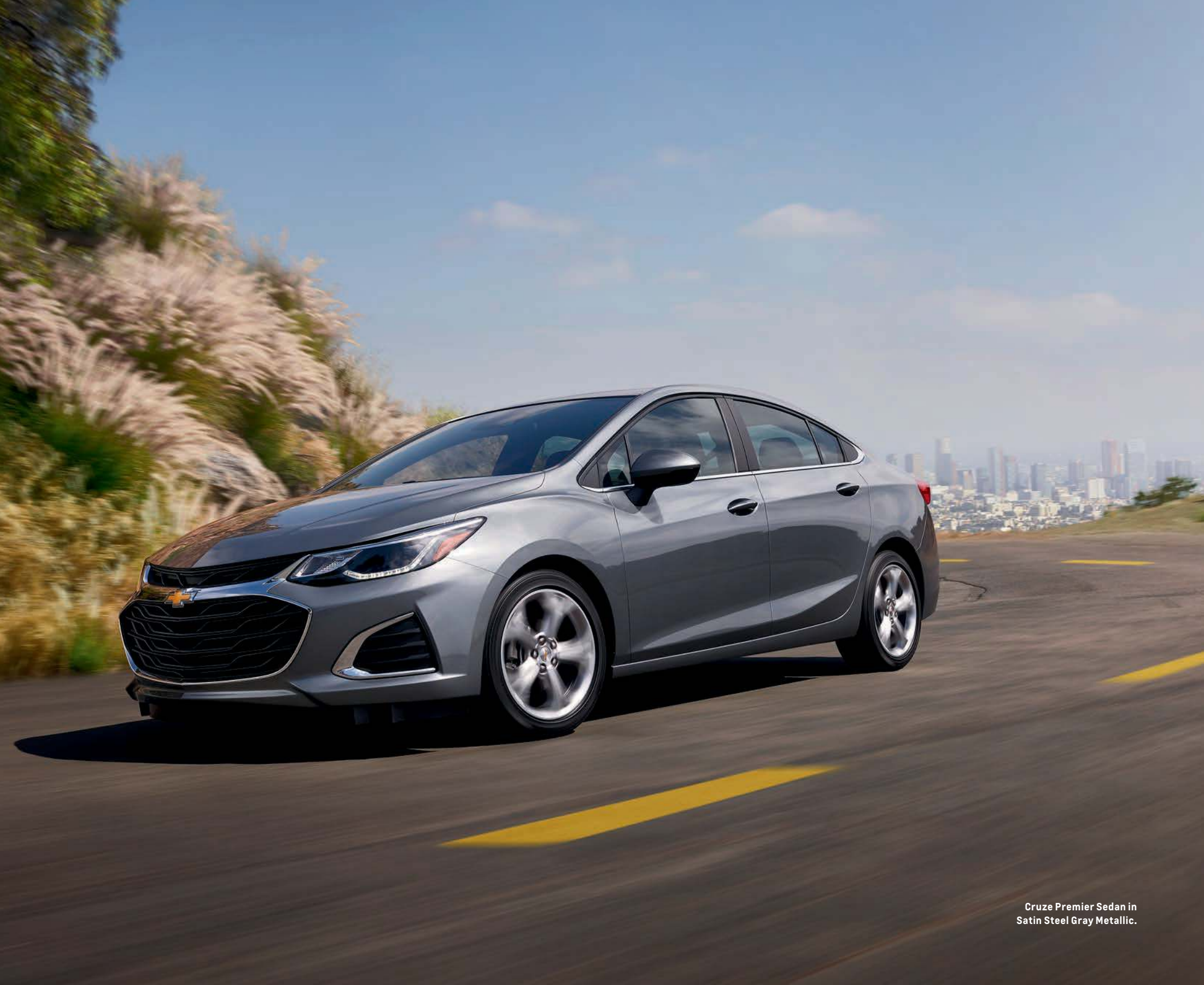
Cruze Premier Sedan in Satin Steel Gray Metallic.