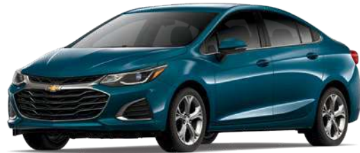
PACIFIC BLUE METALLIC 1,3