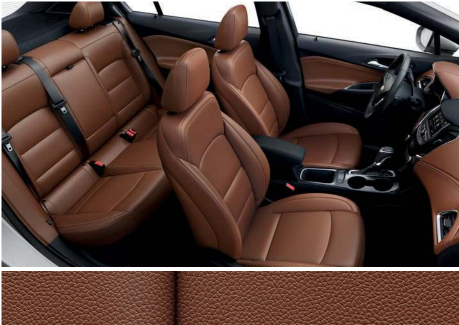
Umber Leatherette with Jet Black Accents 1,2