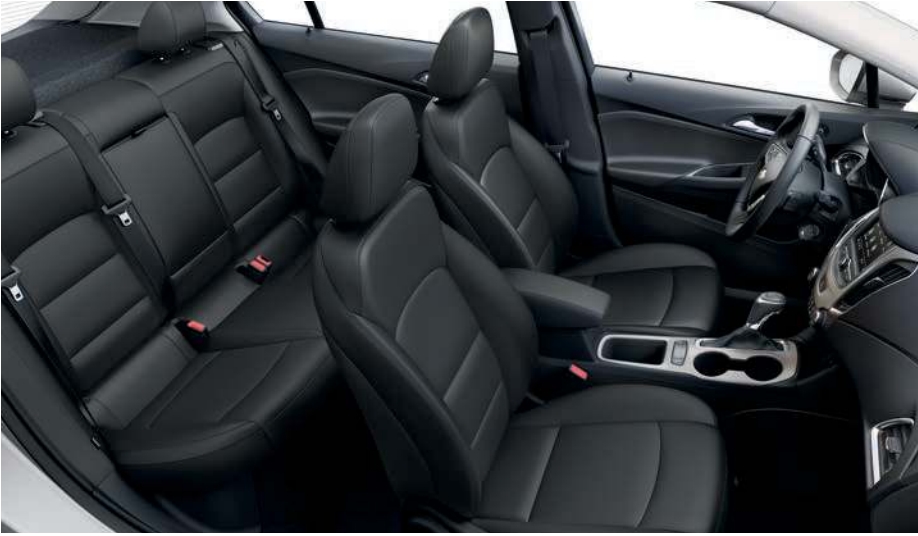
Jet Black Leatherette 1,2