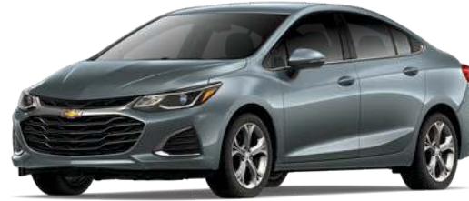
SATIN STEEL GRAY METALLIC 1,3