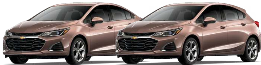
OAKWOOD METALLIC 5