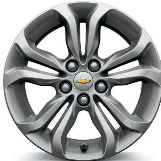
16" Aluminum (Standard on LT and Diesel; included with LS Convenience Package)