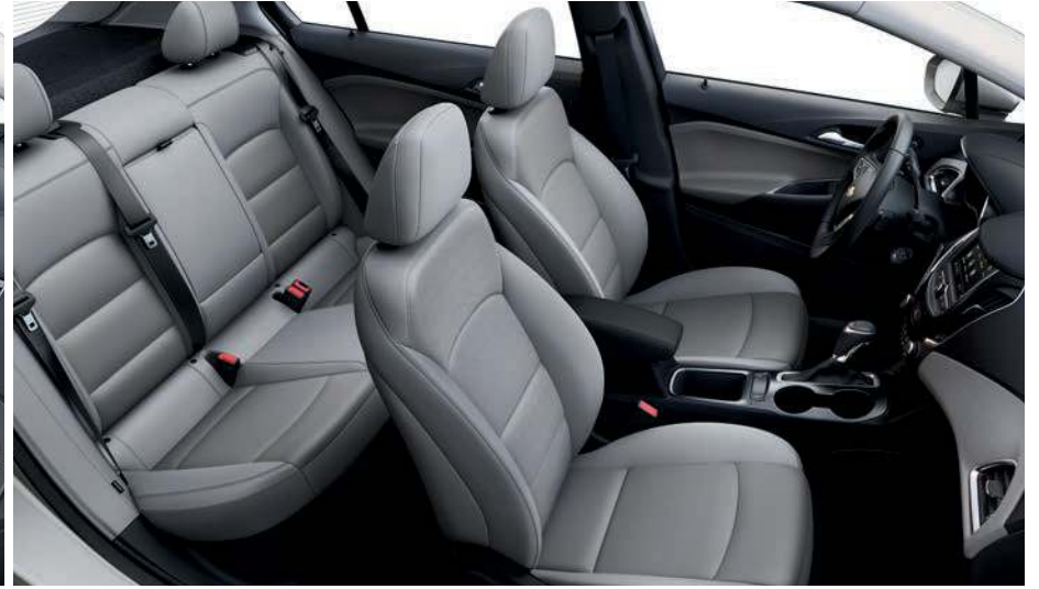
Galvanized Leatherette with Jet Black Accents 1,2