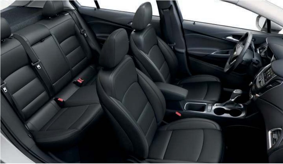
Jet Black Cloth with Jet Black Accents 3