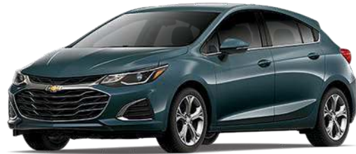
GRAPHITE METALLIC 1,2