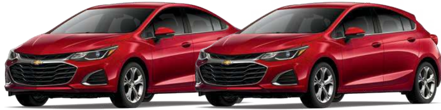
CAJUN RED TINTCOAT 1,2