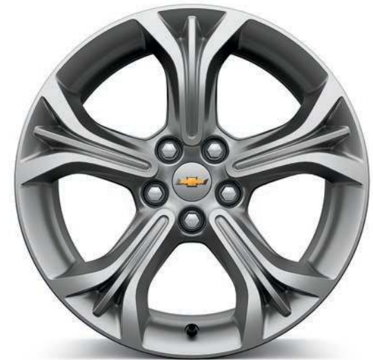
17" Aluminum (Standard on Premier)