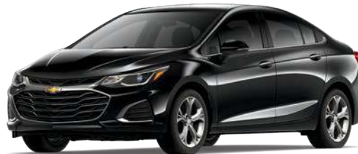
MOSAIC BLACK METALLIC 3,6