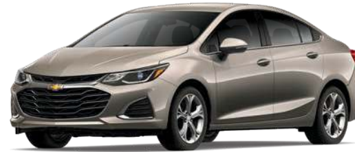
PEPPERDUST METALLIC 3,4