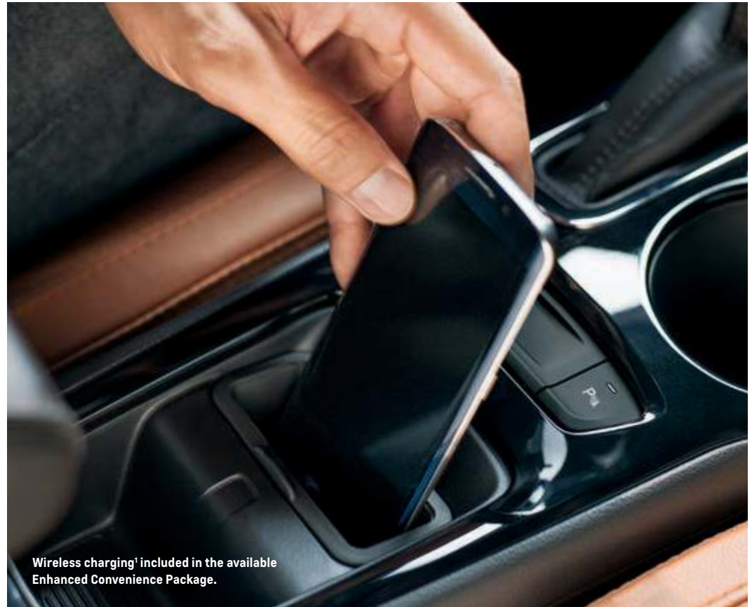
Wireless charging 1 included in the available Enhanced Convenience Package.