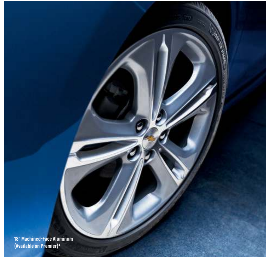
18" Machined-Face Aluminum (Available on Premier) 4