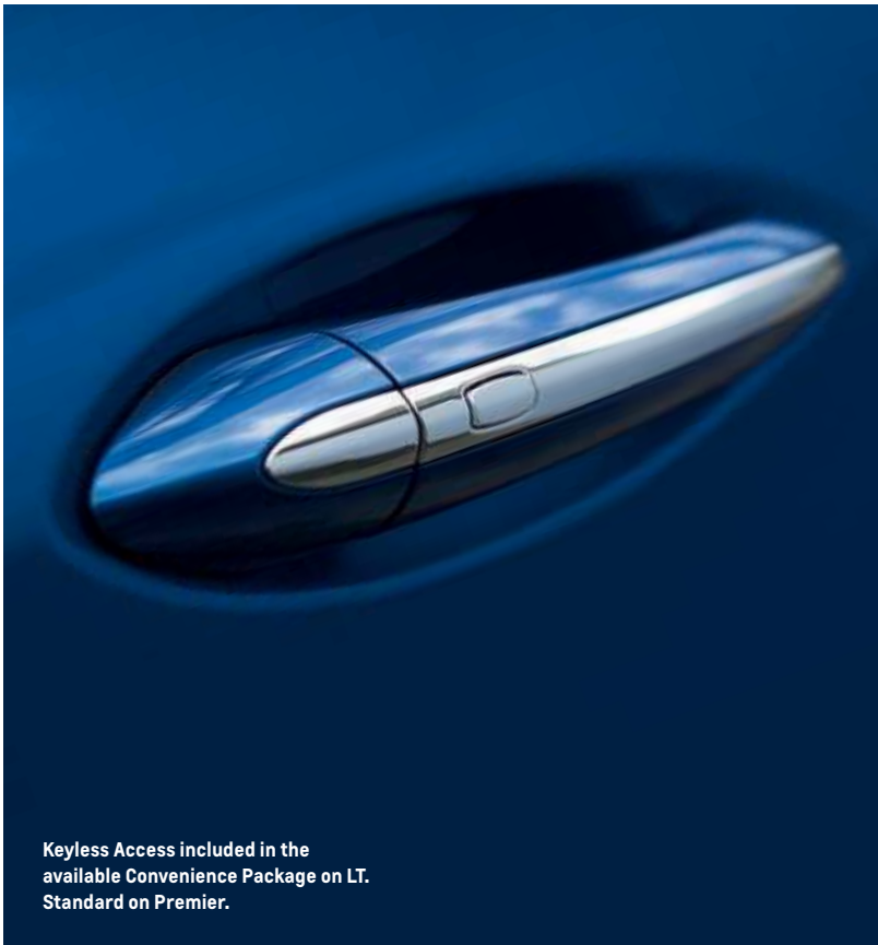
Keyless Access included in the available Convenience Package on LT. Standard on Premier.