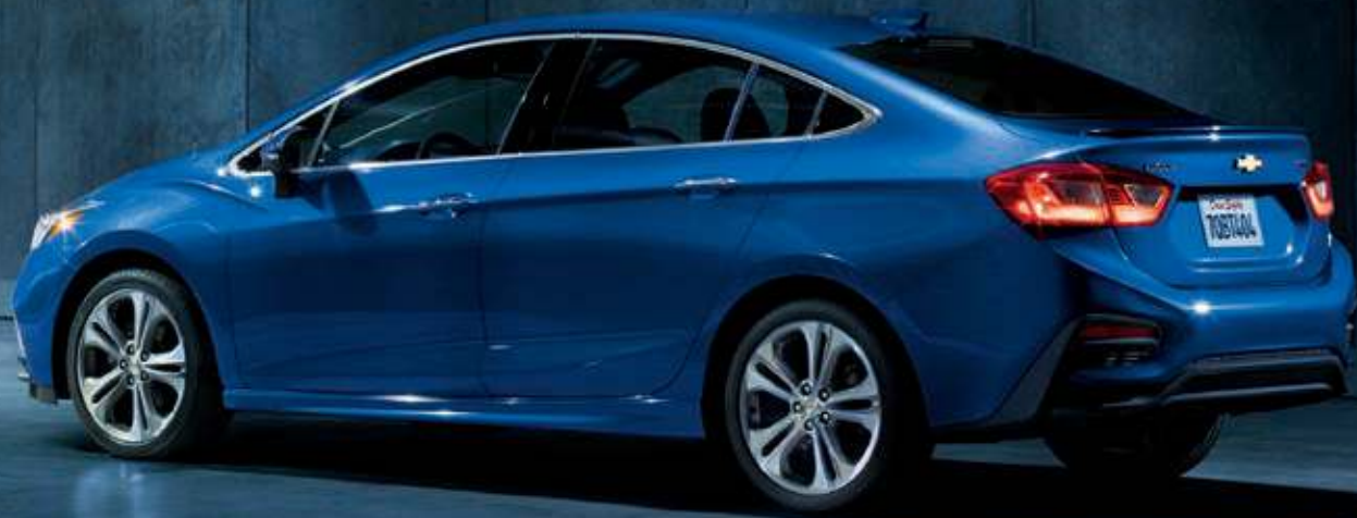
Cruze Premier in Kinetic Blue Metallic (extra-cost color) with available features including the RS Package.