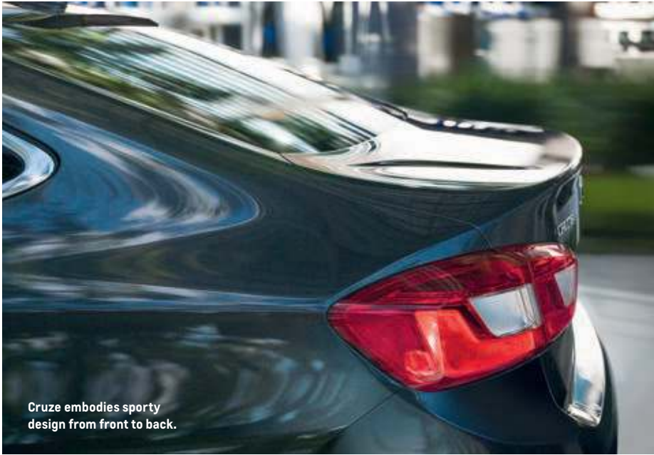
Cruze embodies sporty design from front to back.