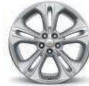
18" Machined-Face Aluminum (Available on Premier) 4