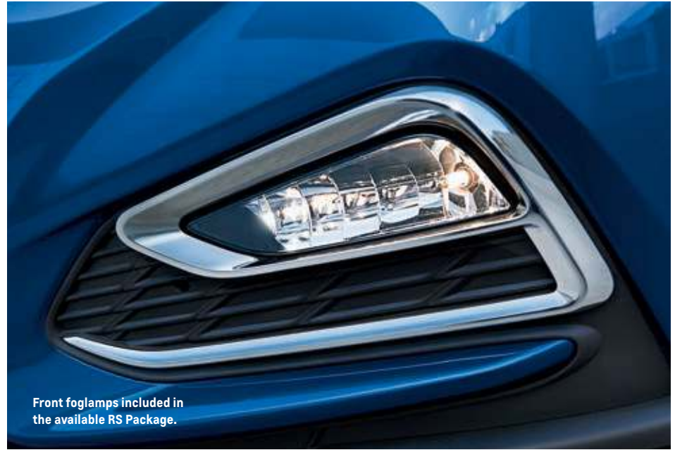
Front foglamps included in the available RS Package.