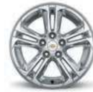
16" Aluminum (Standard on LT)