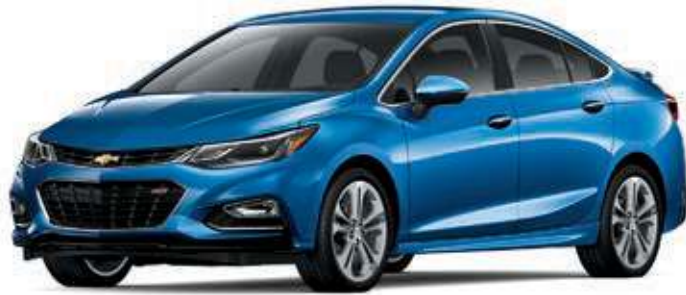
KINETIC BLUE METALLIC 1,2