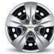
15" Steel with Painted Wheel Covers (Standard on L and LS)