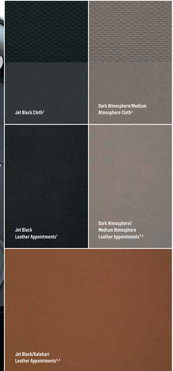
Jet Black Cloth 2