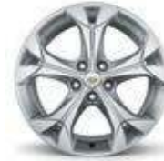
17" Aluminum (Standard on Premier)