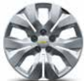
16" Silver-Painted Wheel Cover (Standard on LS)