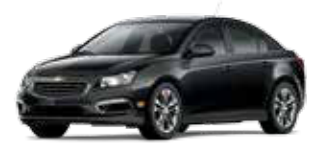
TUNGSTEN METALLIC 3