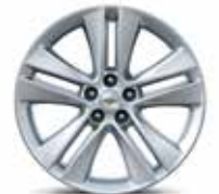
18" Split 5-Spoke Flangeless Silver-Painted Alloy (Standard on LTZ)