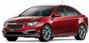
SIREN RED TINTCOAT 1,3,4