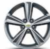
17" 5-Spoke Flangeless Aluminum (Standard on 2LT)