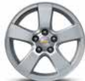
16" 5-Spoke Machined-Face Aluminum (Standard on 1LT)