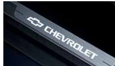
Door Sill Plates