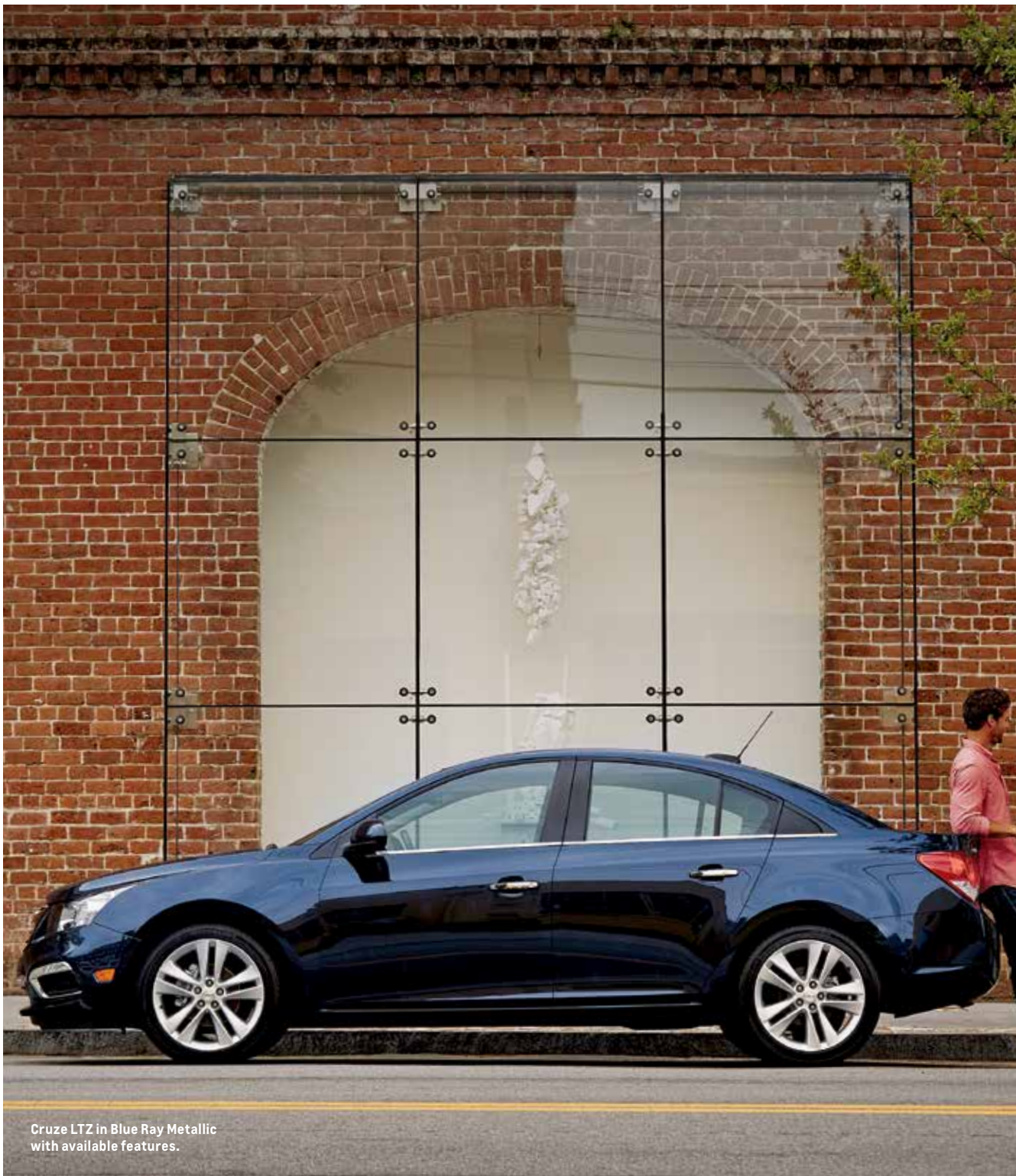
Cruze LTZ in Blue Ray Metallic with available features.