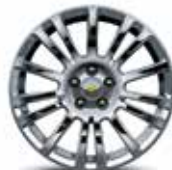
17" 15-Spoke Forged Lightweight Polished Alloy (Standard on Eco)