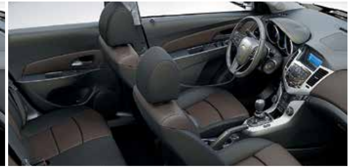
Brownstone Cloth 3,4