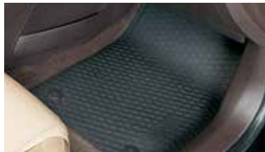
All-Weather Floor Mats