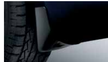
Splash Guards 5