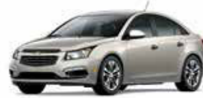
CHAMPAGNE SILVER METALLIC 3