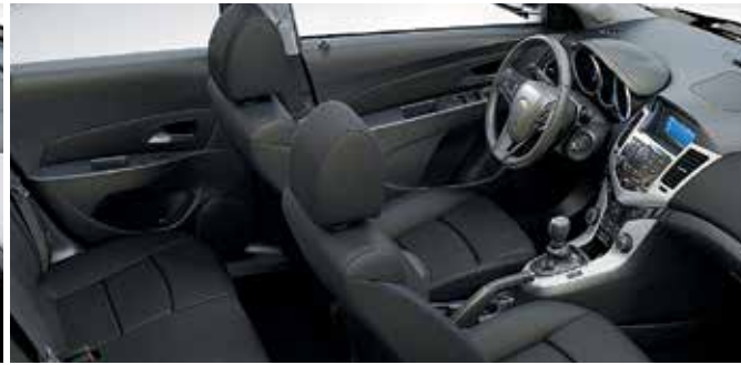
Jet Black Premium Cloth 3