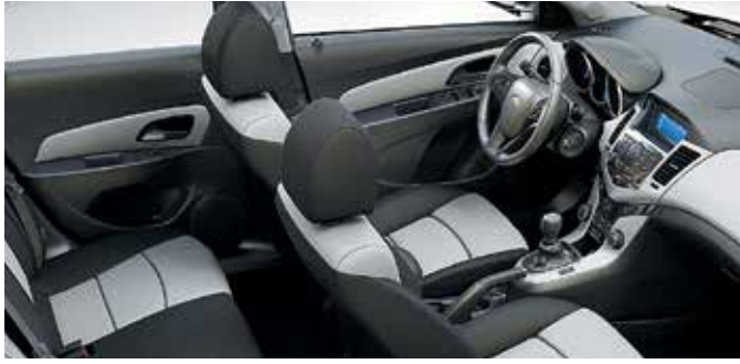
Jet Black/Medium Titanium-Color Premium Cloth 1