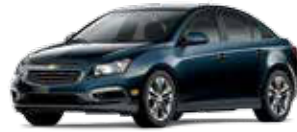
BLUE RAY METALLIC 2