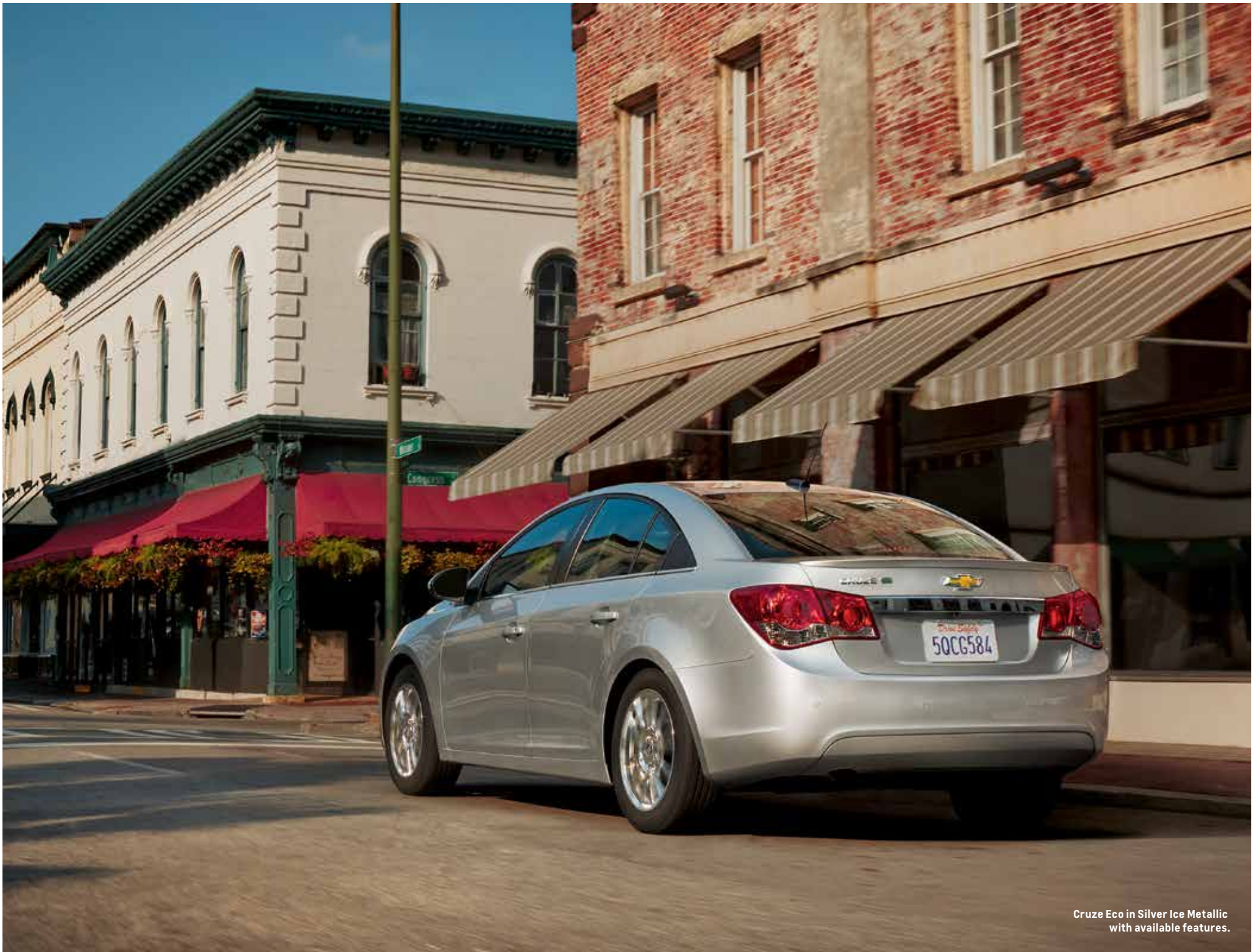
Cruze Eco in Silver Ice Metallic with available features.