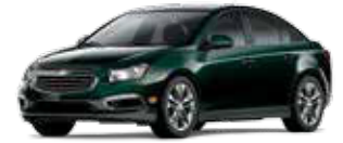
RAINFORREST GREEN METALLIC 1,3