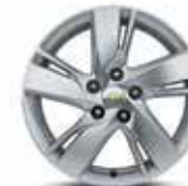
17" Aluminum (Standard on Diesel)