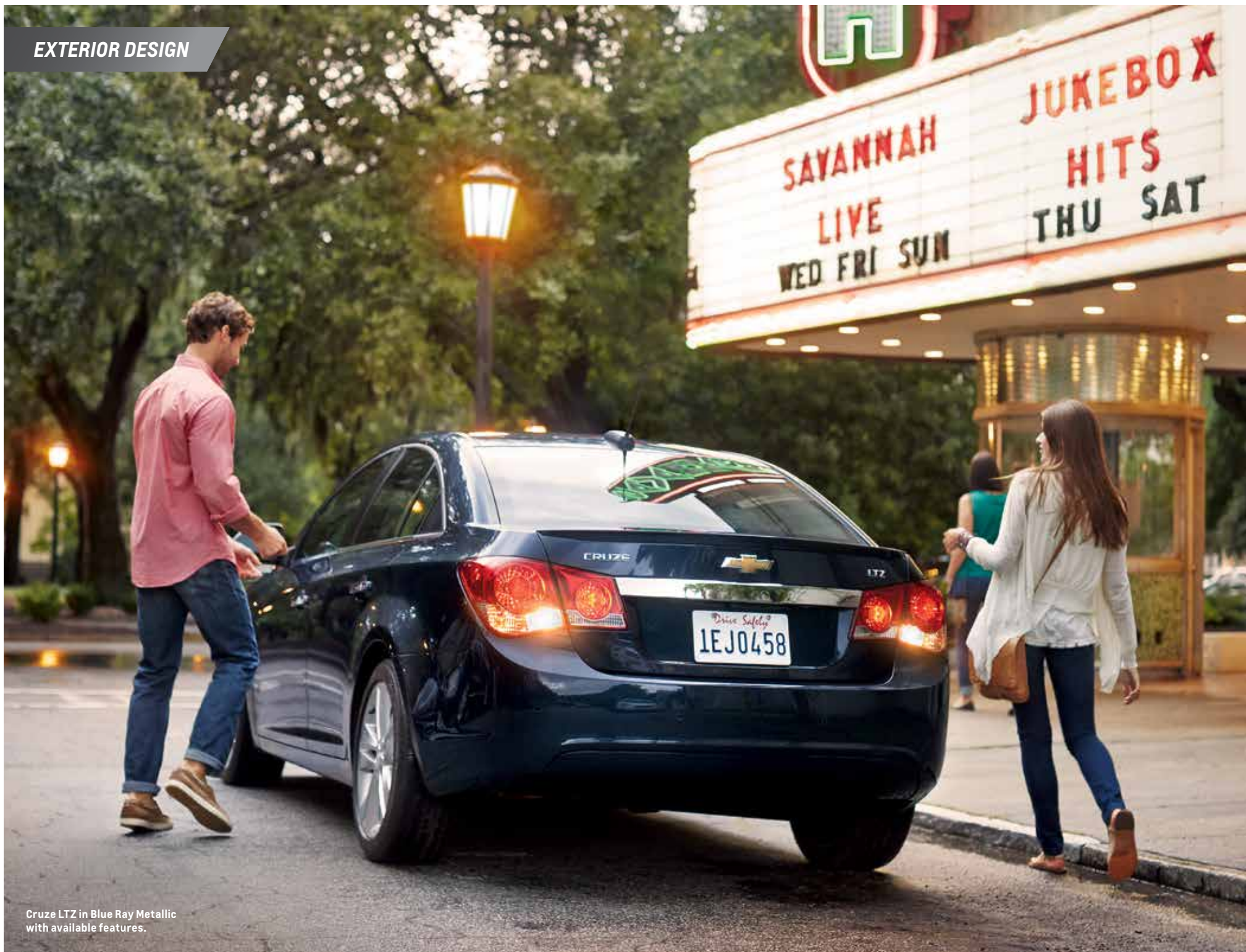
Cruze LTZ in Blue Ray Metallic with available features.