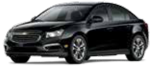
BLACK GRANITE METALLIC 1