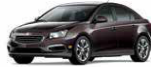
AUTUMN BRONZE METALLIC 1,3,4