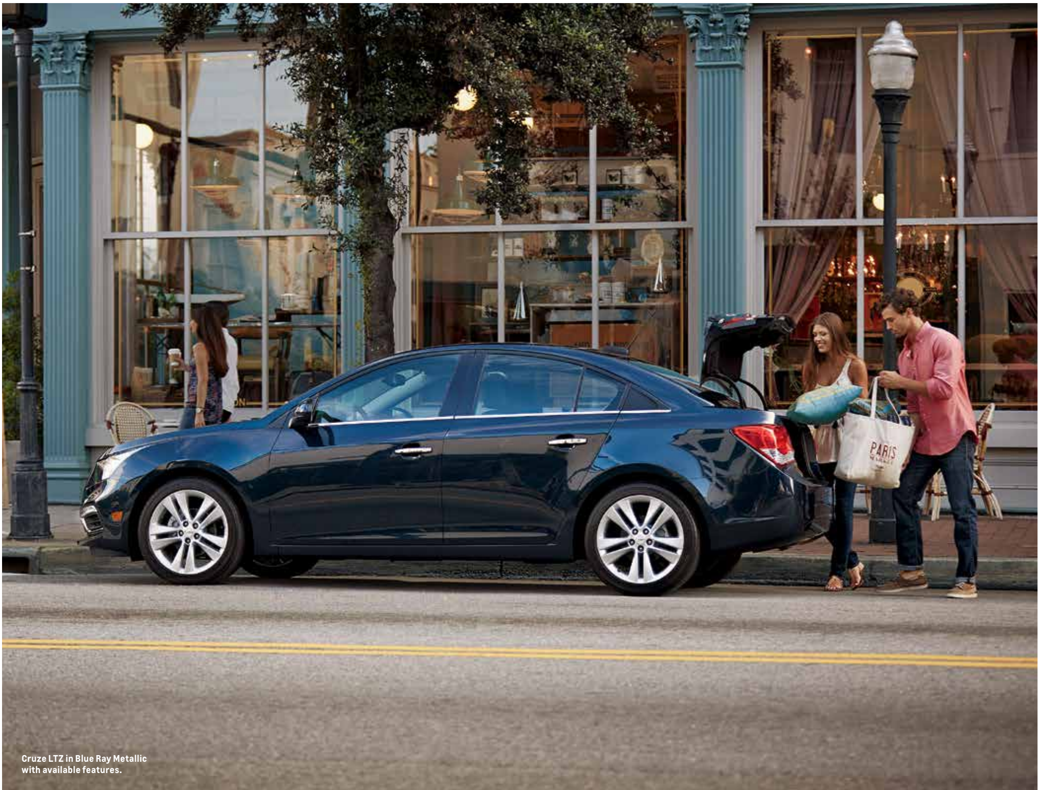
Cruze LTZ in Blue Ray Metallic with available features.