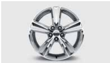
17" Chrome Wheels

PERSONALIZE YOUR CRUZE AT CHEVROLET.COM/ACCESSORIES