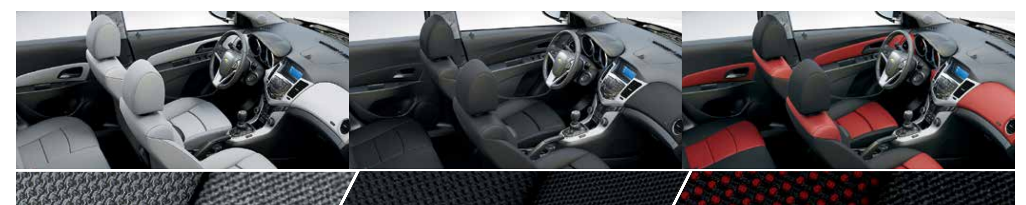
Medium Titanium-Color Premium Cloth<sup>2</sup>

Jet Black/Medium Titanium-Color Premium Cloth<sup>1</sup>