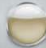
CLEAR WHITE & PLATINUM GOLD (EX DESIGNER PACKAGE)