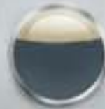
PLATINUM GOLD & GRAVITY GRAY (EX DESIGNER PACKAGE)