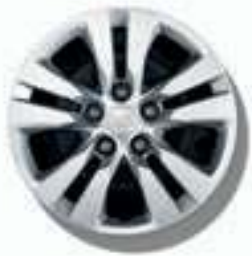
LX 16" STEEL WHEELS

Soul offers the following unique wheel designs: