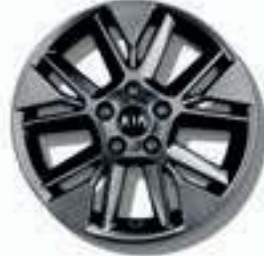
EX 17" ALLOY WHEELS