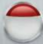
INFERNO RED & CLEAR WHITE (GT-LINE)