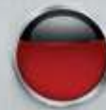
CHERRY BLACK & INFERNO RED (GT-LINE)