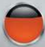
CHERRY BLACK & MARS ORANGE (X-LINE)