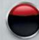
INFERNO RED & CHERRY BLACK (GT-LINE)