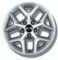
S 16" ALLOY WHEELS