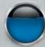
CHERRY BLACK & NEPTUNE BLUE (X-LINE)