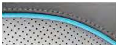
SOUL EV + plus GRAY LEATHER WITH BLUE PIPING