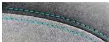
SOUL EV-e/EV GRAY CLOTH WITH BLUE STITCHING