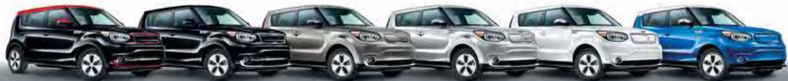
SHADOW BLACK W/INFERNO RED ROOF (EV + plus ) ONLY