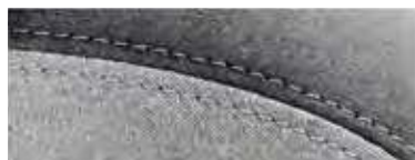
SOUL EV GRAY CLOTH WITH GRAY STITCHING (SHADOW BLACK EXTERIOR ONLY)