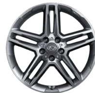
19" Alloy Wheel SE Ultimate/Limited Ultimate