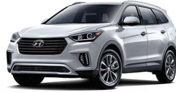
2018 Santa Fe SE (7-passenger)