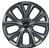
19" Alloy Wheel 2.0T Ultimate