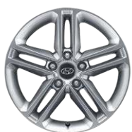
17" Alloy Wheel 2.4L