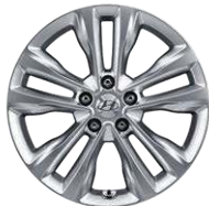
18" Alloy Wheel 2.0T