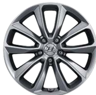
18" Alloy Wheel SE