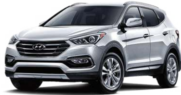
2018 Santa Fe Sport 2.0T