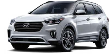
2018 Santa Fe Limited Ultimate (6-passenger)