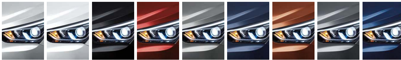
Sparkling Silver Pearl White Twilight Black Serrano Red Mineral Gray Marlin Blue Canyon Copper Platinum Graphite Nightfall Blue