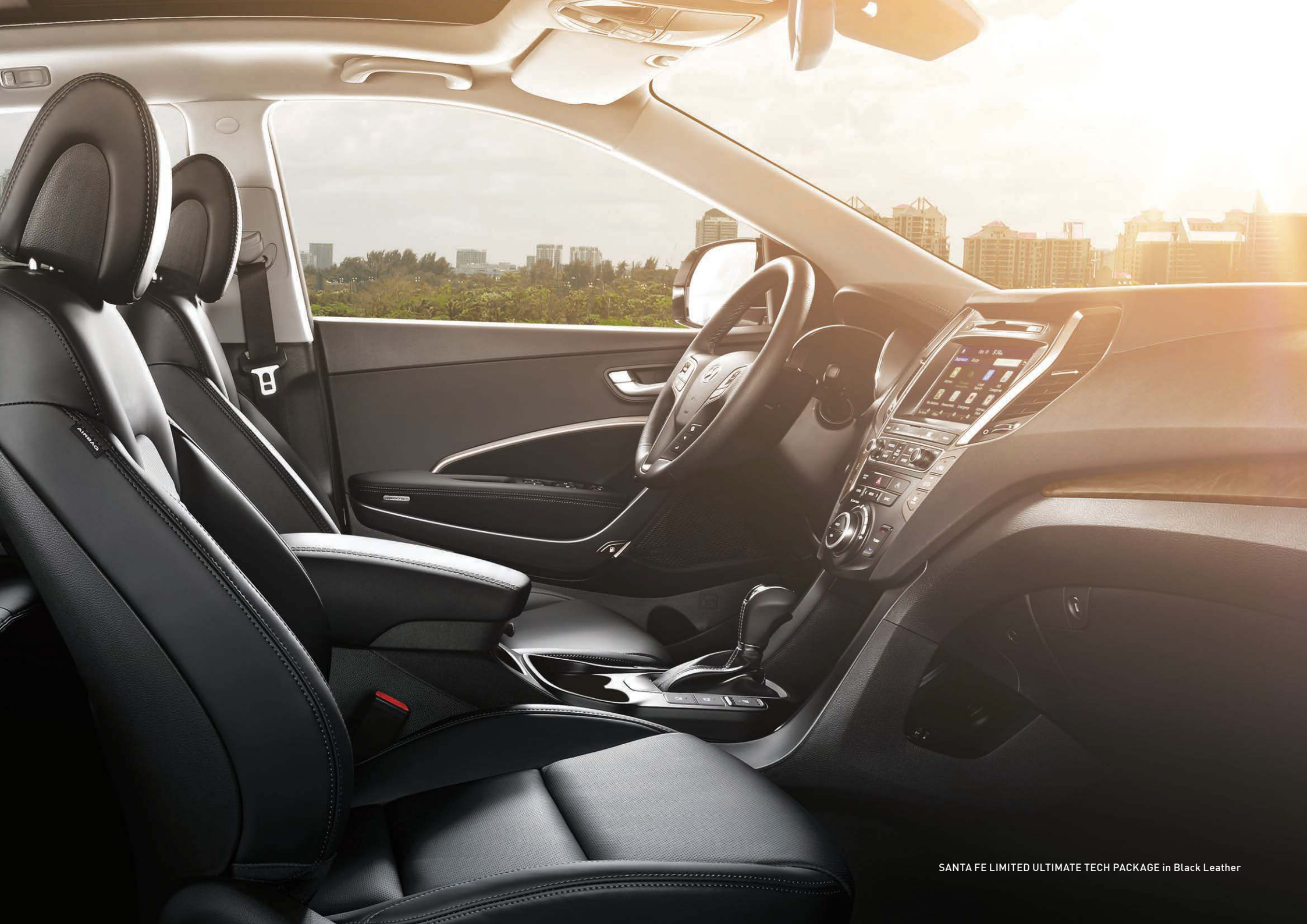
SANTA FE LIMITED ULTIMATE TECH PACKAGE in Black Leather