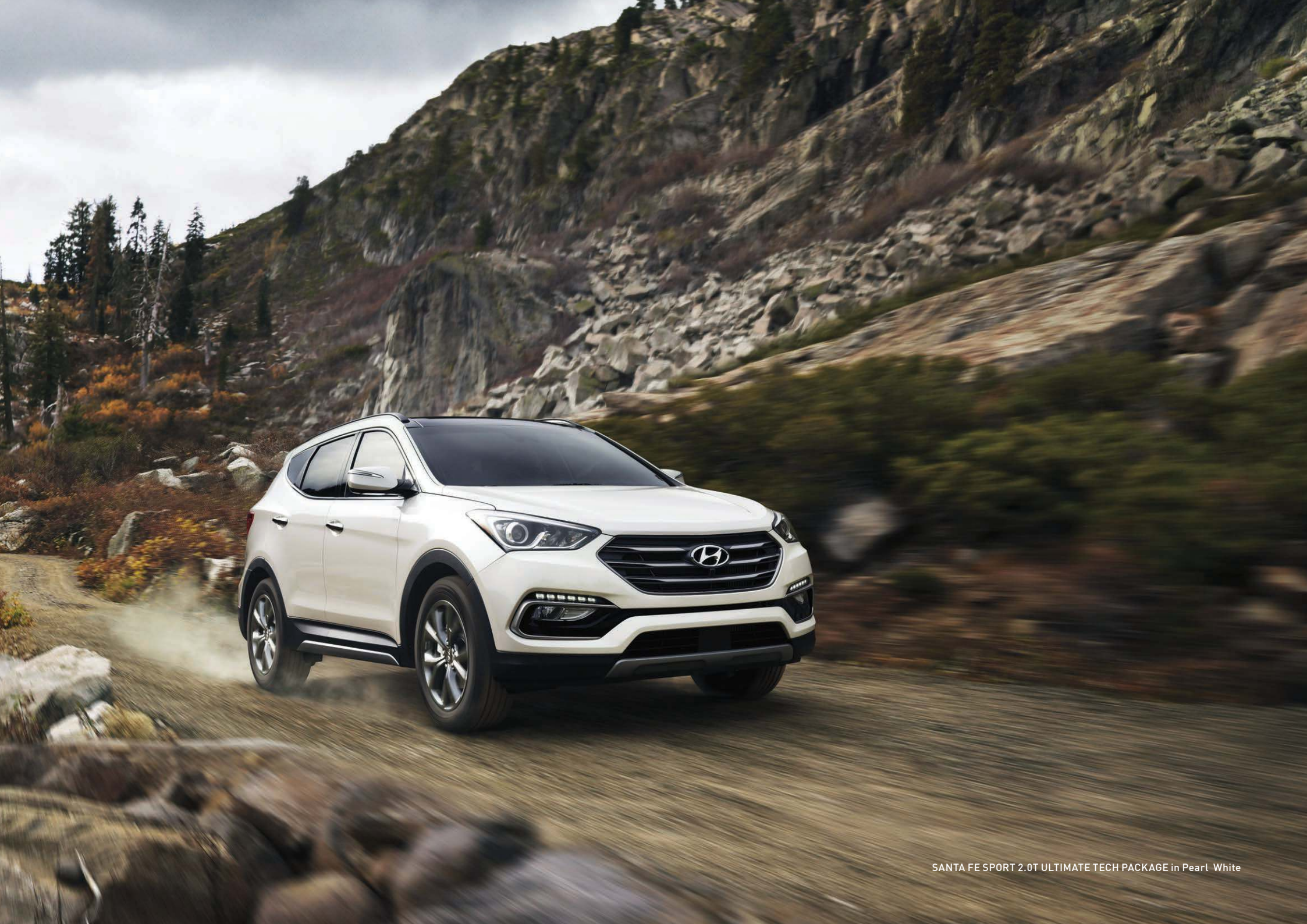
SANTA FE SPORT 2.0T ULTIMATE TECH PACKAGE in Pearl White