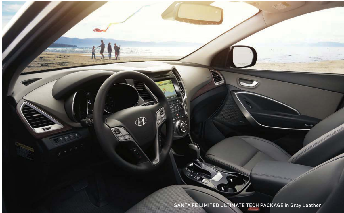
SANTA FE LIMITED ULTIMATE TECH PACKAGE in Gray Leather