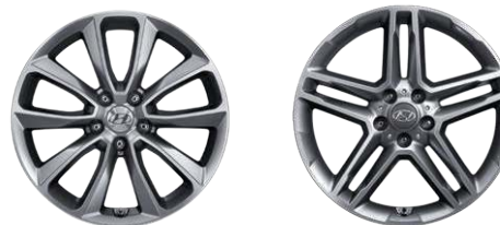
18" Alloy Wheel (Santa Fe Standard) 19" Alloy Wheel (Santa Fe Optional)