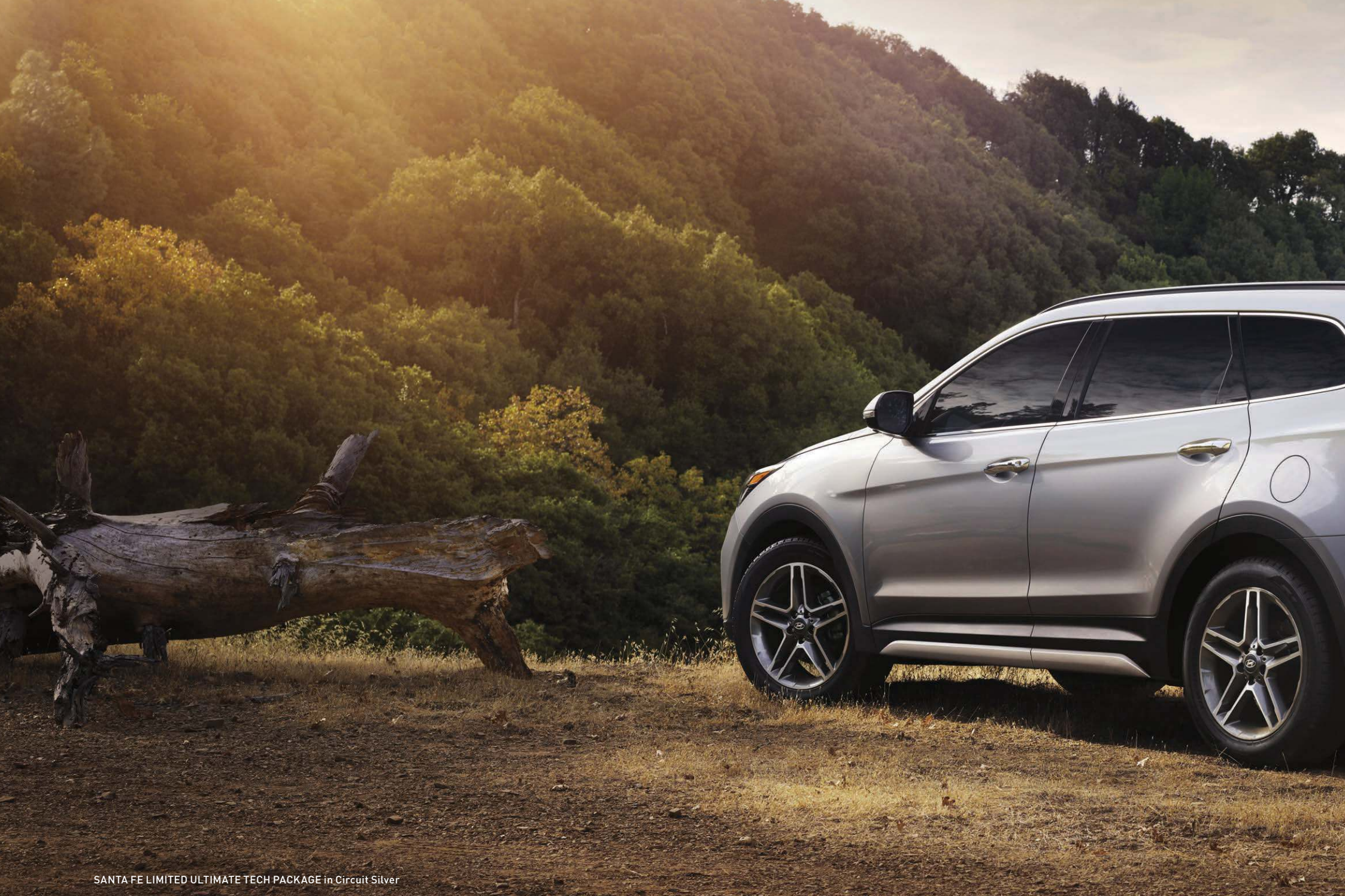
SANTA FE LIMITED ULTIMATE TECH PACKAGE in Circuit Silver