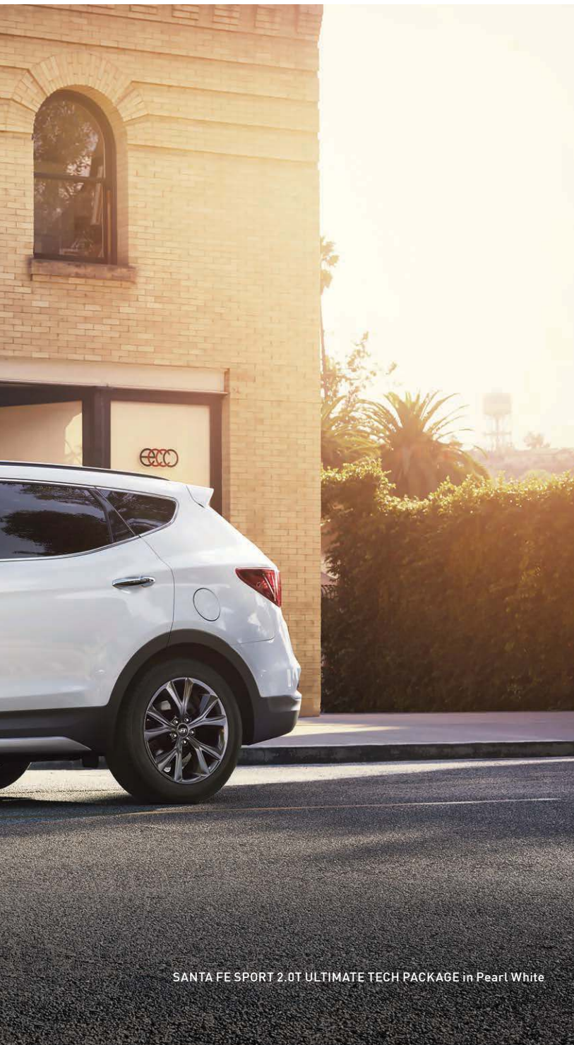
SANTA FE SPORT 2.0T ULTIMATE TECH PACKAGE in Pearl White