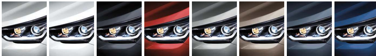
Circuit Silver Monaco White Becketts Black Regal Red Pearl Iron Frost Java Espresso Night Sky Pearl Storm Blue