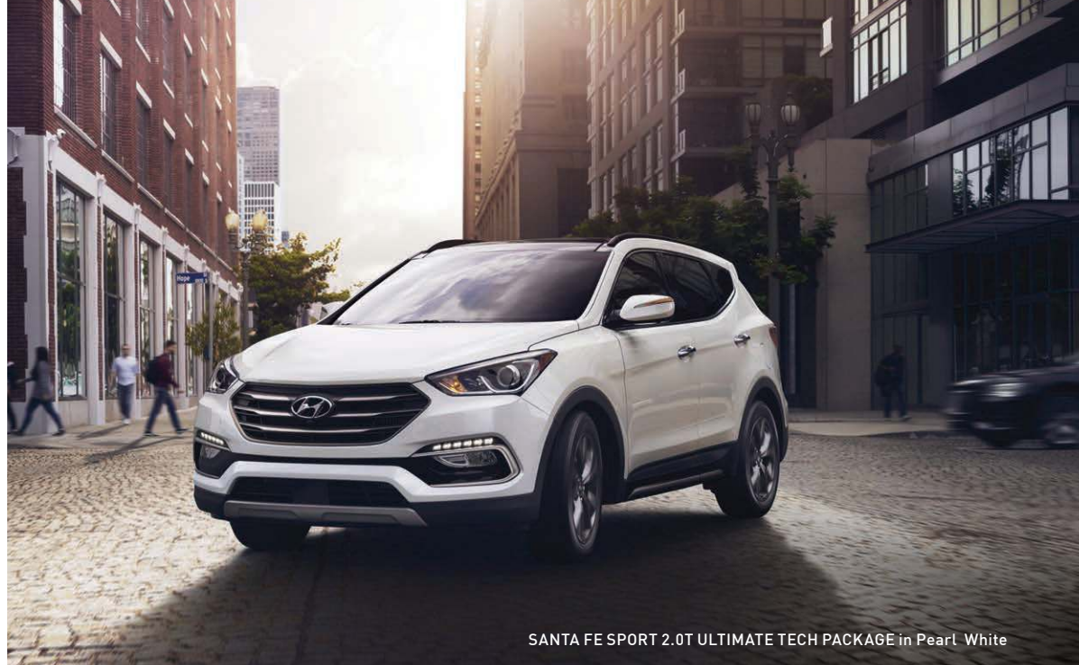
SANTA FE SPORT 2.0T ULTIMATE TECH PACKAGE in Pearl White