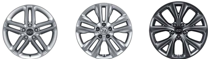
17" Alloy Wheel (2.4L Santa Fe Sport Standard) 18" Alloy Wheel (2.0T Santa Fe Sport Standard) 19" Alloy Wheel (2.0T Santa Fe Sport Optional)