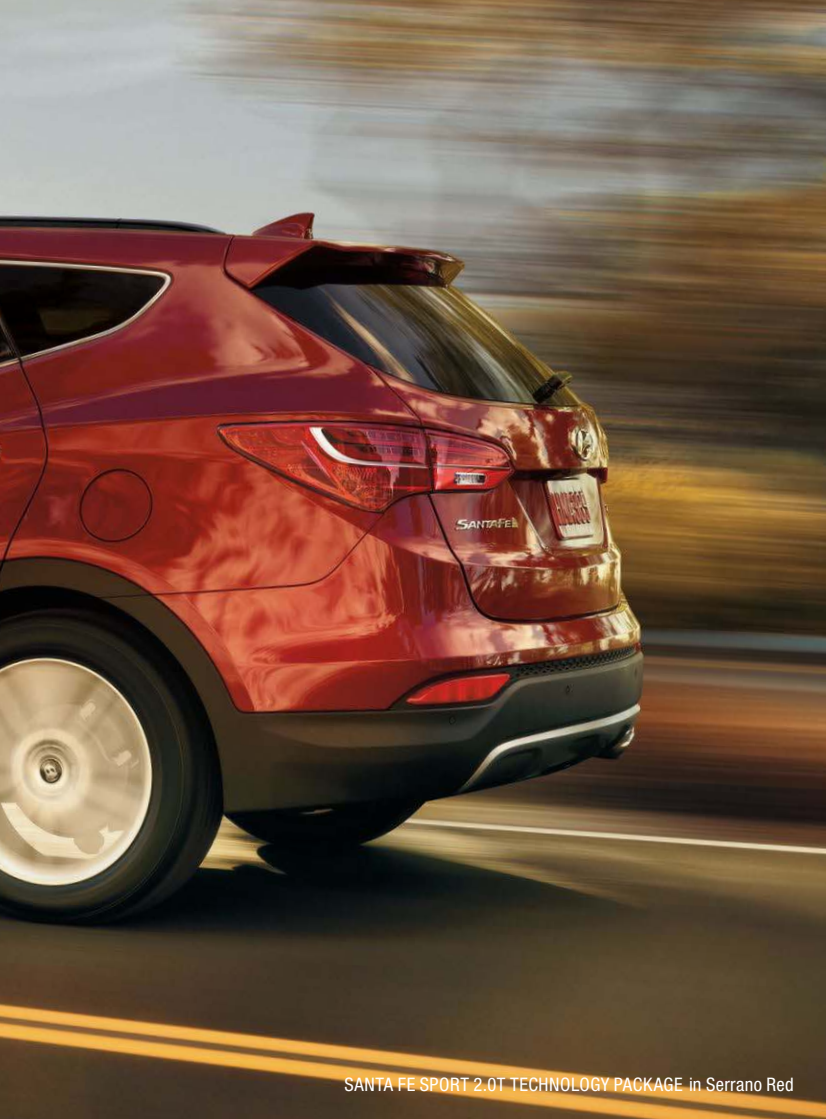
SANTA FE SPORT 2.0T TECHNOLOGY PACKAGE in Serrano Red