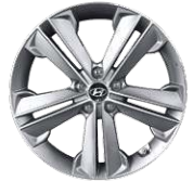
19" ALUMINUM ALLOY WHEEL