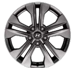
17" ALUMINUM ALLOY WHEEL