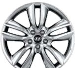
19" ALUMINUM ALLOY WHEEL