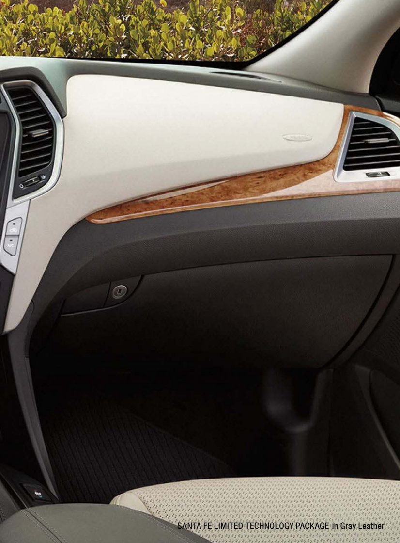
SANTA FE LIMITED TECHNOLOGY PACKAGE in Gray Leather