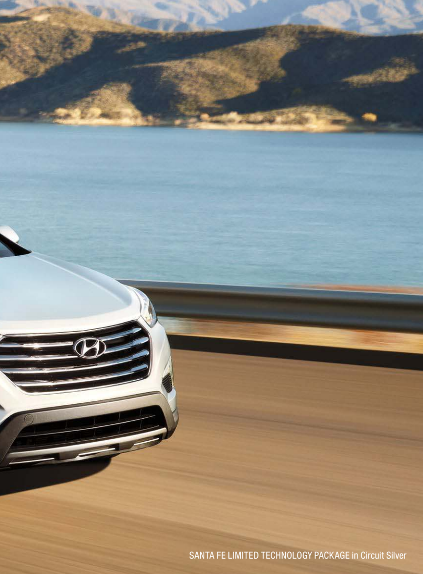
SANTA FE LIMITED TECHNOLOGY PACKAGE in Circuit Silver