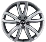
18" ALUMINUM ALLOY WHEEL