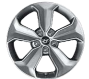
18" ALUMINUM ALLOY WHEEL