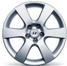
18-INCH SE/LIMITED ALLOY WHEEL