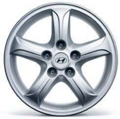
16-INCH GLS ALLOY WHEEL