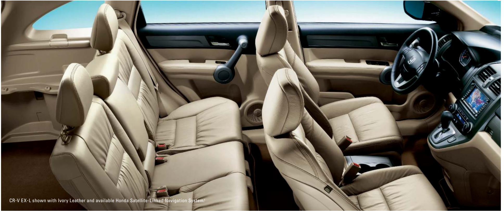
CR-V EX-L shown with Ivory Leather and available Honda Satellite-Linked Navigation System. 1