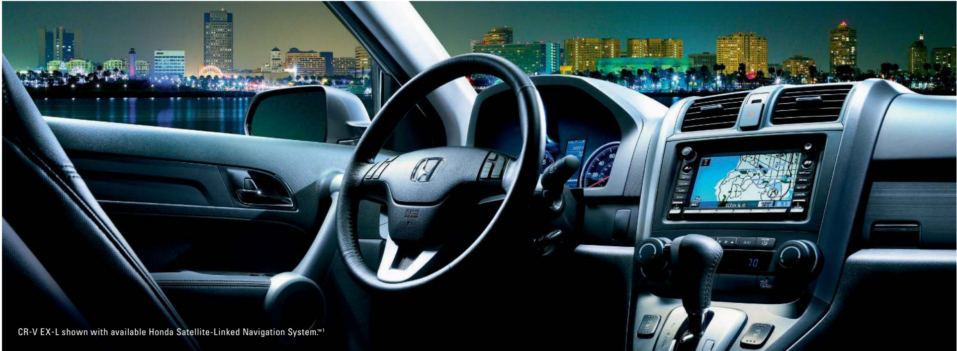
CR-V EX-L shown with available Honda Satellite-Linked Navigation System. TM1