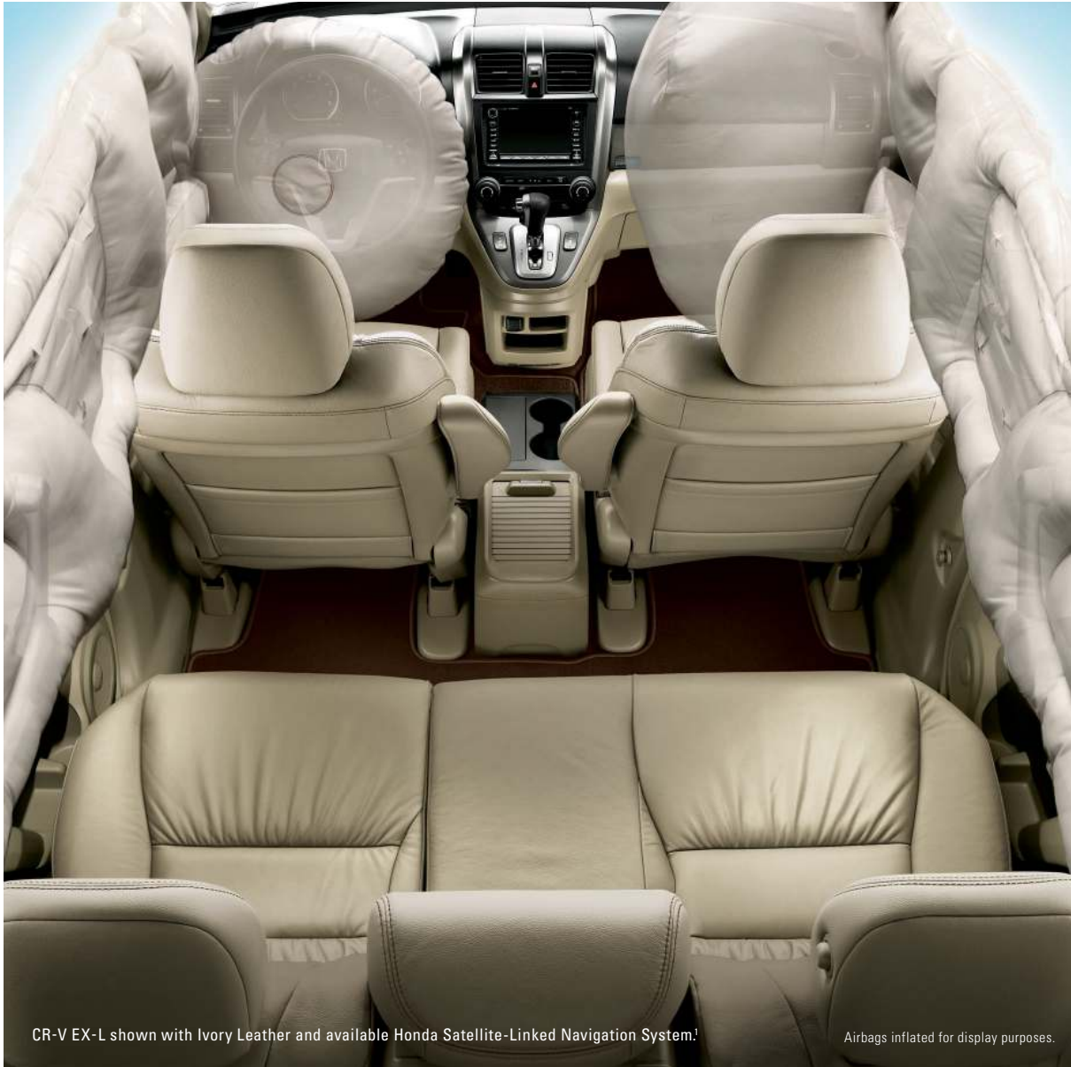
CR-V EX-L shown with Ivory Leather and available Honda Satellite-Linked Navigation System.†