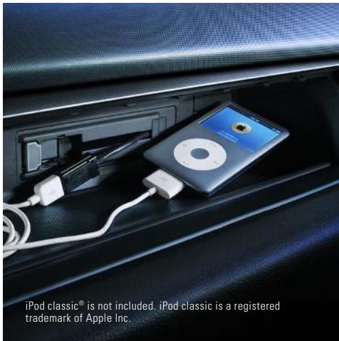
iPod classic ® is not included. iPod classic is a registered trademark of Apple Inc.

All CR-V audio systems can play MP3- and Windows Media ® Audio 3 (WMA)-compatible CDs. On SE, EX and EX-L models, a 6-disc in-dash changer is standard, and the EX-L model adds XM ® Radio. 4