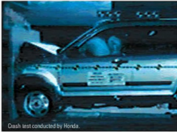
Crash test conducted by Honda.