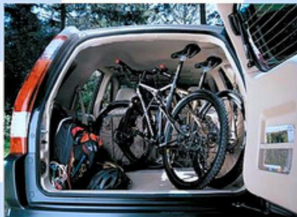
Forget the rack – just load in your bikes.*