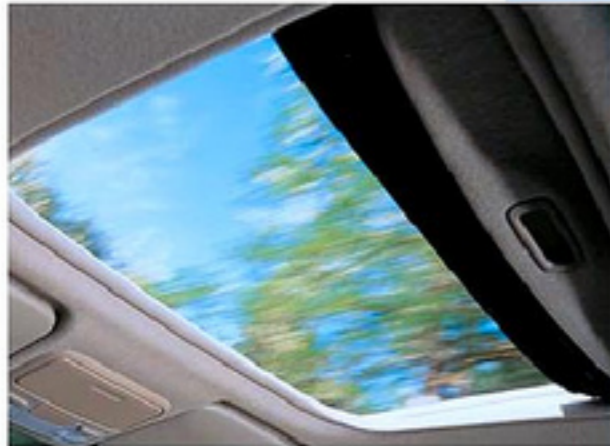
An available moonroof freshens the drive.