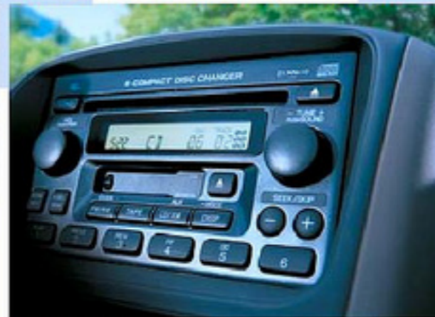
Sound solutions – from CDs to XM readiness. 1