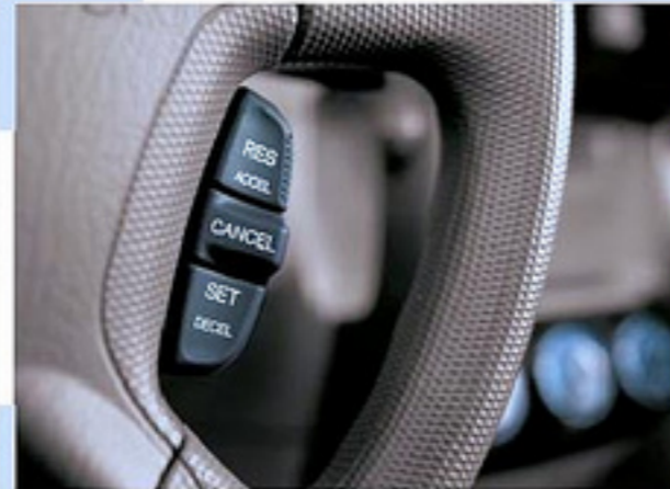
Cruise control: an easy way to thumb a ride.

Load up. It's great to get all the goods.