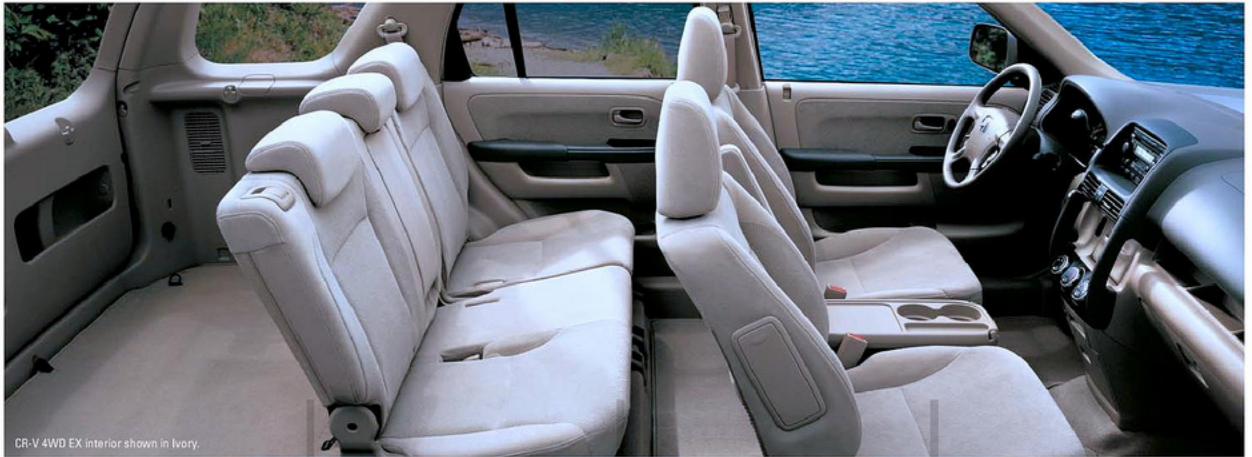
CR-V 4WD EX interior shown in Ivory.