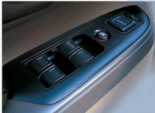
Get standard power windows and mirrors.

Load up. It's great to get all the goods.