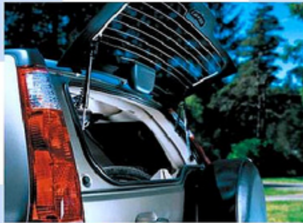
The swing-up glass hatch eases access.

Step inside and the CR-V is at the ready with a host of bins and door pockets, beverage holders for folks both in front and in the back, and even front and rear 12-volt power outlets. And there are plenty of tie-down anchors to keep things secure.