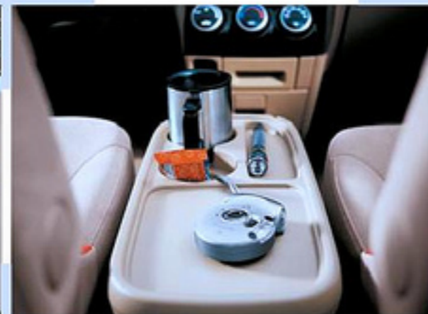
The retractable center tray can make way.