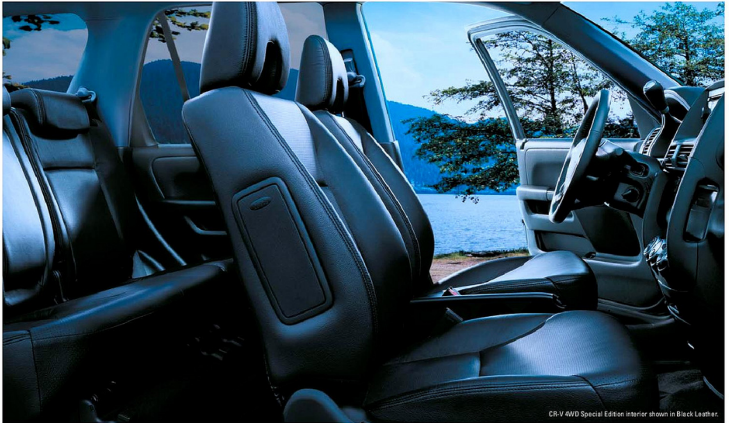
CR-V 4WD Special Edition interior shown in Black Leather.

The CR-V packs lots of luxury within its no-nonsense, capable self. You immediately appreciate its low step-in height and surprising spaciousness. Its plush seats offer a commanding view of the road. Step up to CR-V Special Edition and, along with unique exterior styling cues, you'll also enjoy its supple leather trim, a leather-wrapped steering wheel, heated front seats and heated side mirrors.