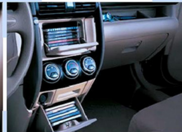
Big storage bins keep things close at hand.