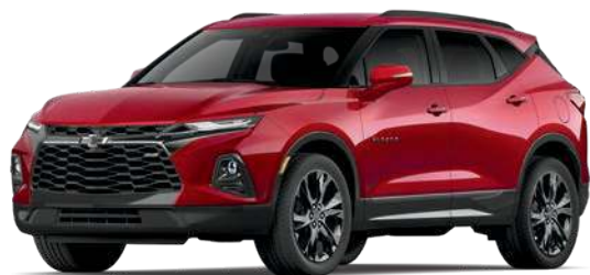
Cherry Red Tintcoat 3,4