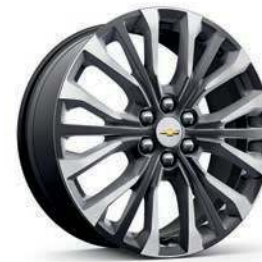
20" Machined-Face Aluminum Wheels with Medium Android-Painted Pockets Standard on Premier