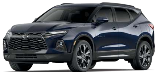
Midnight Blue Metallic 3