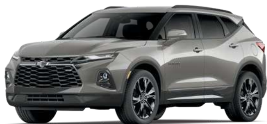
Pewter Metallic 3