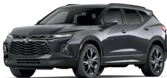
Iron Gray Metallic 3