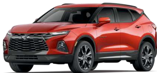
Cayenne Orange Metallic 3,4