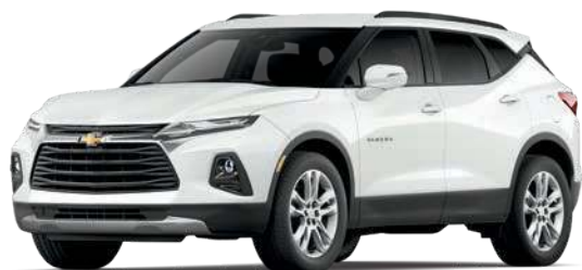
Summit White 1,2