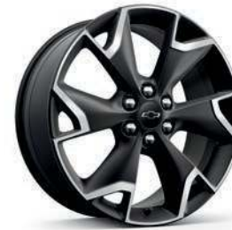
20" Machined-Face Aluminum Wheels with Dark Android-Painted Pockets Standard on RS