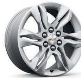
18" Bright Silver-Painted Aluminum Wheels Standard on 1LT and 2LT

Lane Keep Assist with Lane Departure Warning 2