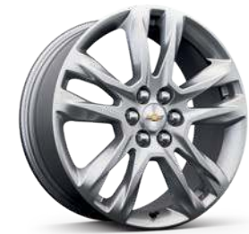
20" Bright Silver-Painted Aluminum Wheels Available on 3LT