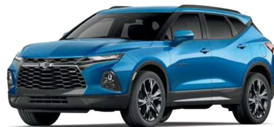
Bright Blue Metallic 4,5