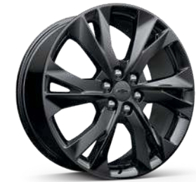
21" Gloss Black-Painted Aluminum Wheels Available on RS

RS In addition to or replacing 3LT features, RS includes: