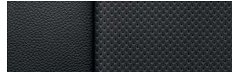
Jet Black Perforated Leather-Appointed Seating Surfaces with Red Accents