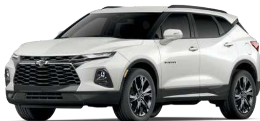
Iridescent Pearl Tricoat 3,4