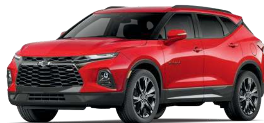
Red Hot 2,3