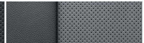
Dark Galvanized/Light Galvanized Perforated Leather-Appointed Seating Surfaces (shown) 2

3LT In addition to or replacing 2LT features, 3LT includes: