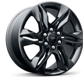
18" Gloss Black-Painted Aluminum Wheels Available on 1LT and 2LT with Midnight/Sport Edition