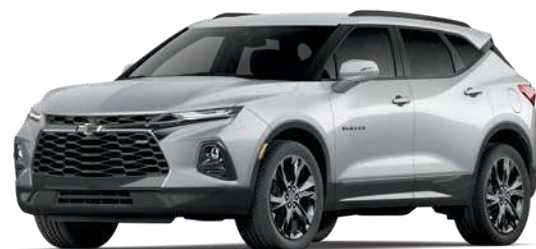
Silver Ice Metallic