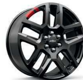
20" Gloss Black-Painted Aluminum Wheels with Red Accents Available on 2LT with Redline Edition