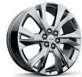
21" Pearl Nickel-Painted Aluminum Wheels Available on Premier

PREMIER In addition to or replacing RS features, Premier includes: