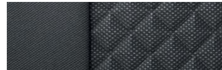
Jet Black Premium Cloth