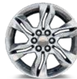
18" Bright Silver-Painted Aluminum Wheels Standard on Blazer