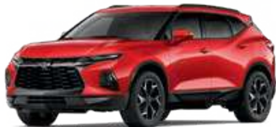
RED HOT 2,5