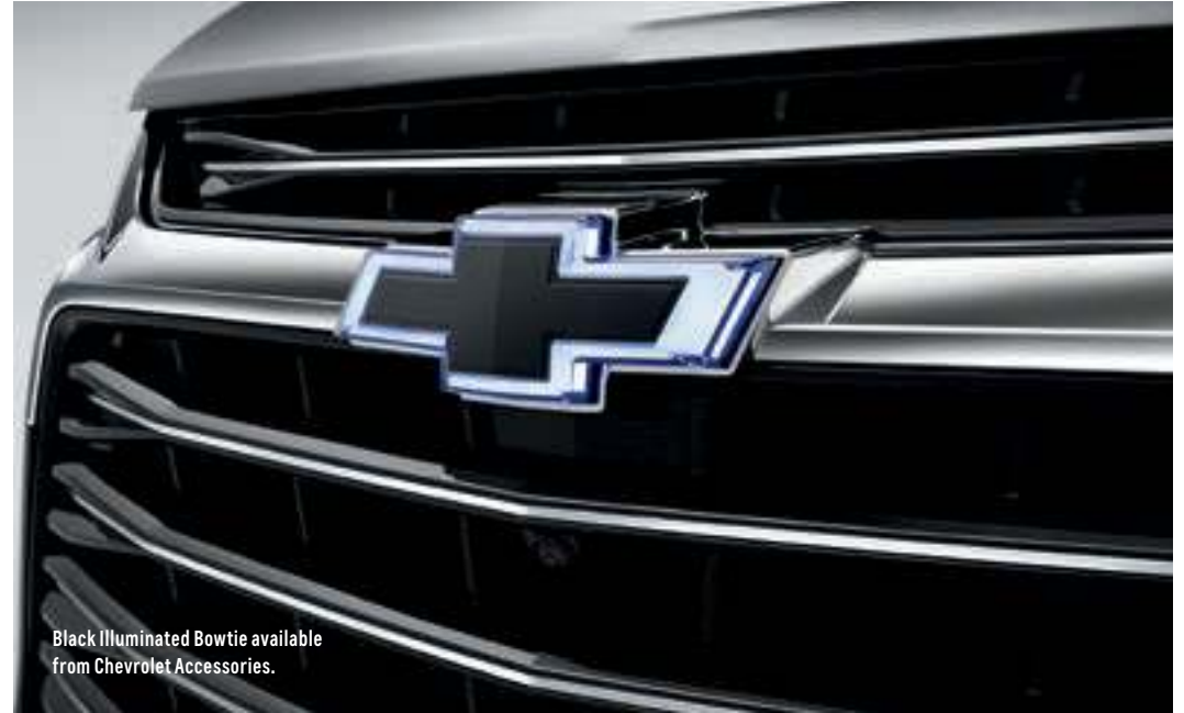
Black Illuminated Bowtie available from Chevrolet Accessories.