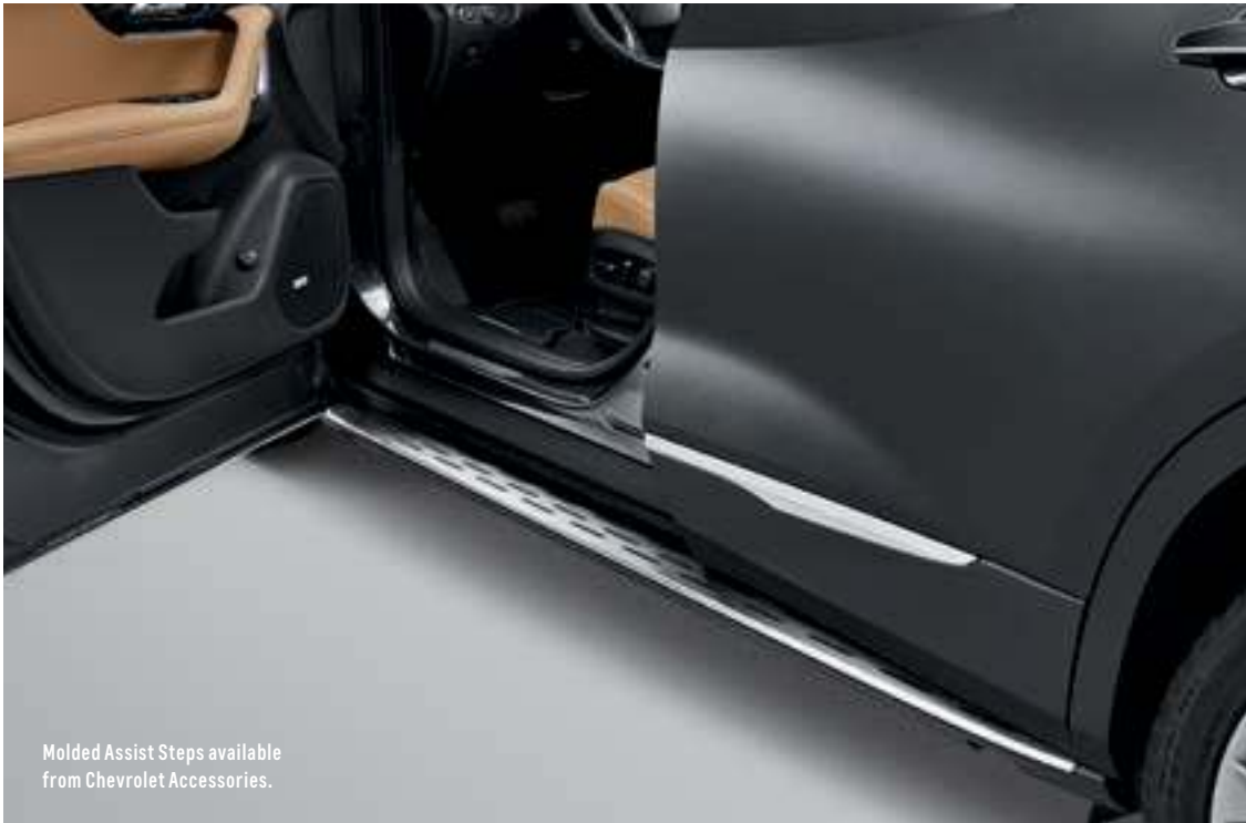
Molded Assist Steps available from Chevrolet Accessories.