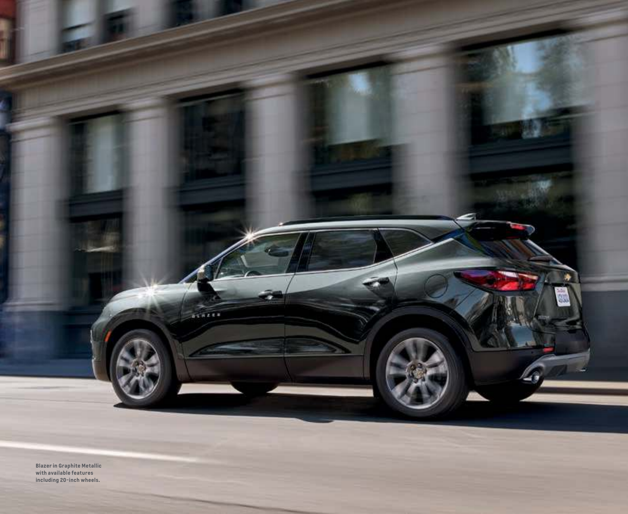
Blazer in Graphite Metallic with available features including 20-inch wheels.