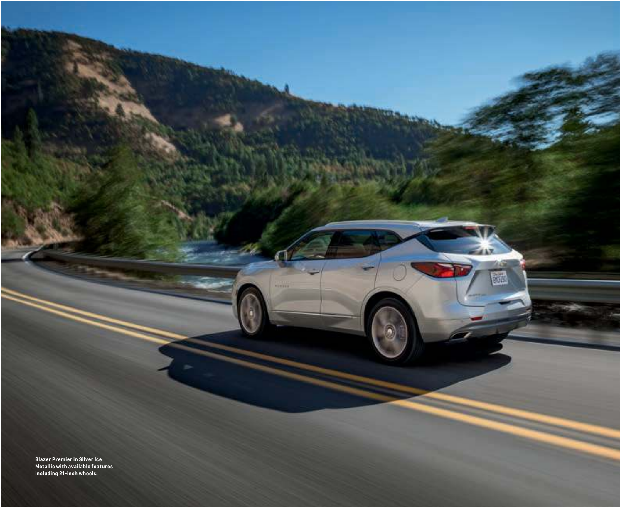
Blazer Premier in Silver Ice Metallic with available features including 21-inch wheels.