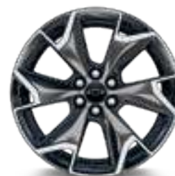
20" Machined-Face Aluminum Wheels with Dark Android-Painted Pockets Standard on RS

Lighting – ambient with pin spot lighting in the map pocket area, True White light pipes on the passenger side of the instrument panel and below the front door handles, and LED lighting between the center console cup holders