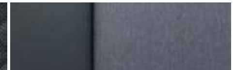
Dark Galvanized/Light Galvanized Premium Cloth