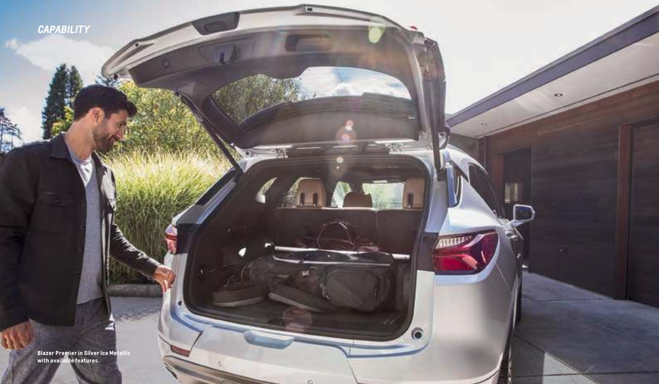
Blazer Premier in Silver Ice Metallic with available features.