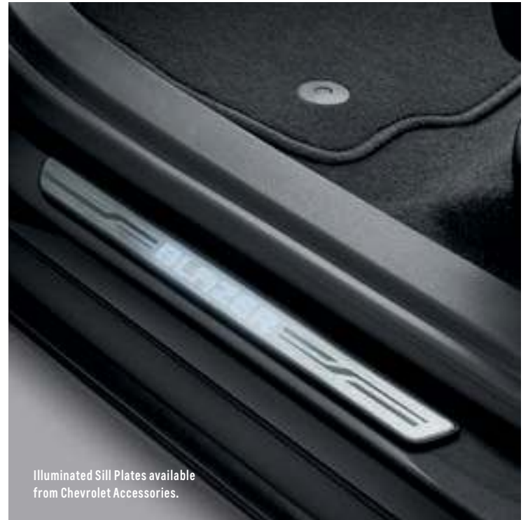
Illuminated Sill Plates available from Chevrolet Accessories.