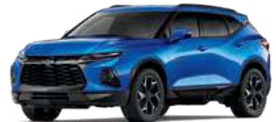
KINETIC BLUE METALLIC 2,5,6