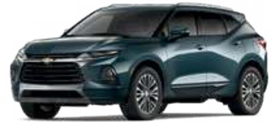
GRAPHITE METALLIC 1