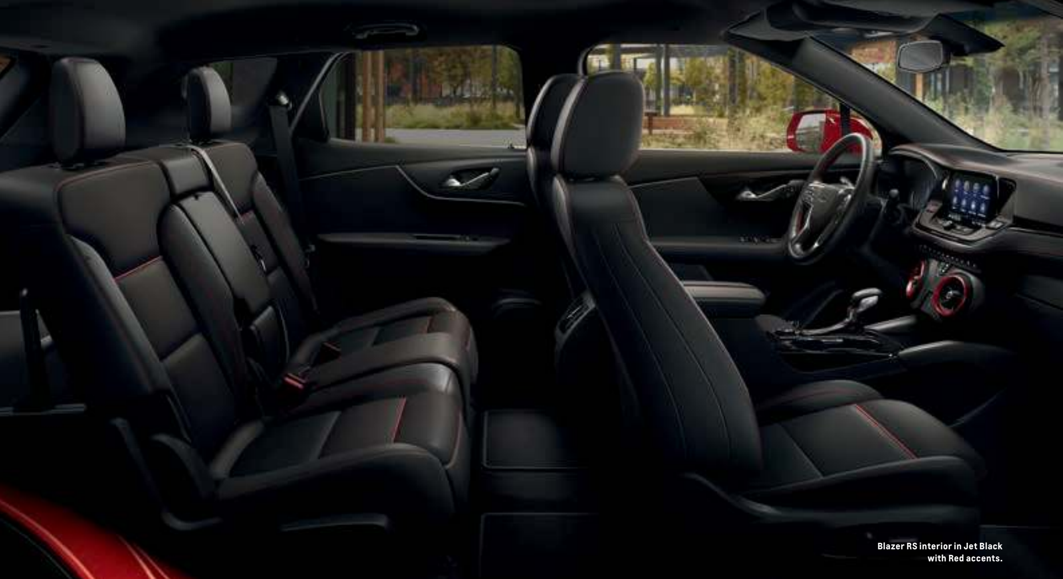
Blazer RS interior in Jet Black with Red accents.

THE HEART OF RS. A Jet Black interior with leather-appointed seating surfaces welcomes you into RS. Perforations in the seat cushions reveal Red accents. The theme continues with Red piping on the seats and Red-tinted chrome on the circular air vents and shift knob.