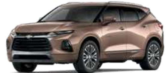
OAKWOOD METALLIC 3,4