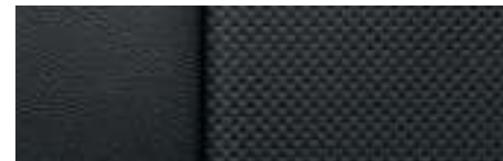
Jet Black Perforated Leather-Appointed Seating Surfaces with Sueded Microfiber Inserts