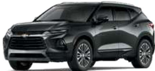
NIGHTFALL GRAY METALLIC 1