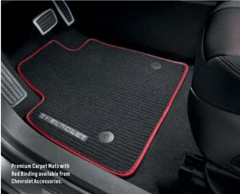
Premium Carpet Mats with Red Binding available from Chevrolet Accessories.