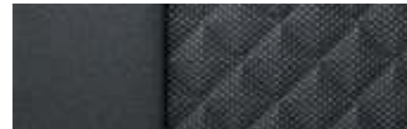
Jet Black Premium Cloth