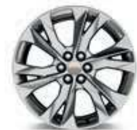
21" Pearl Nickel-Painted Aluminum Wheels Available on Premier with Sun and Wheels Package