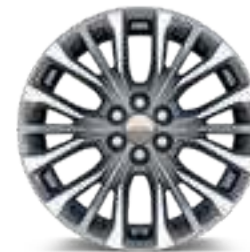
20" Machined-Face Aluminum Wheels with Medium Android-Painted Pockets Standard on Premier

Seating surfaces – leather-appointed with sueded microfiber inserts