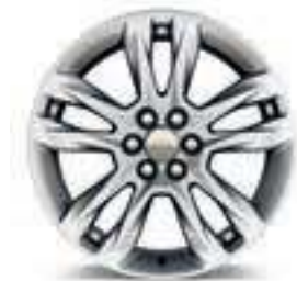
20" Bright Silver-Painted Aluminum Wheels Available on Blazer with Sun and Wheels Package