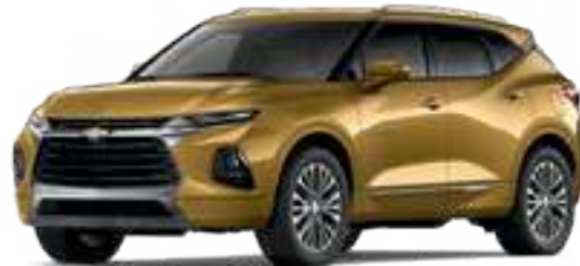
SUNLIT BRONZE METALLIC 1,2