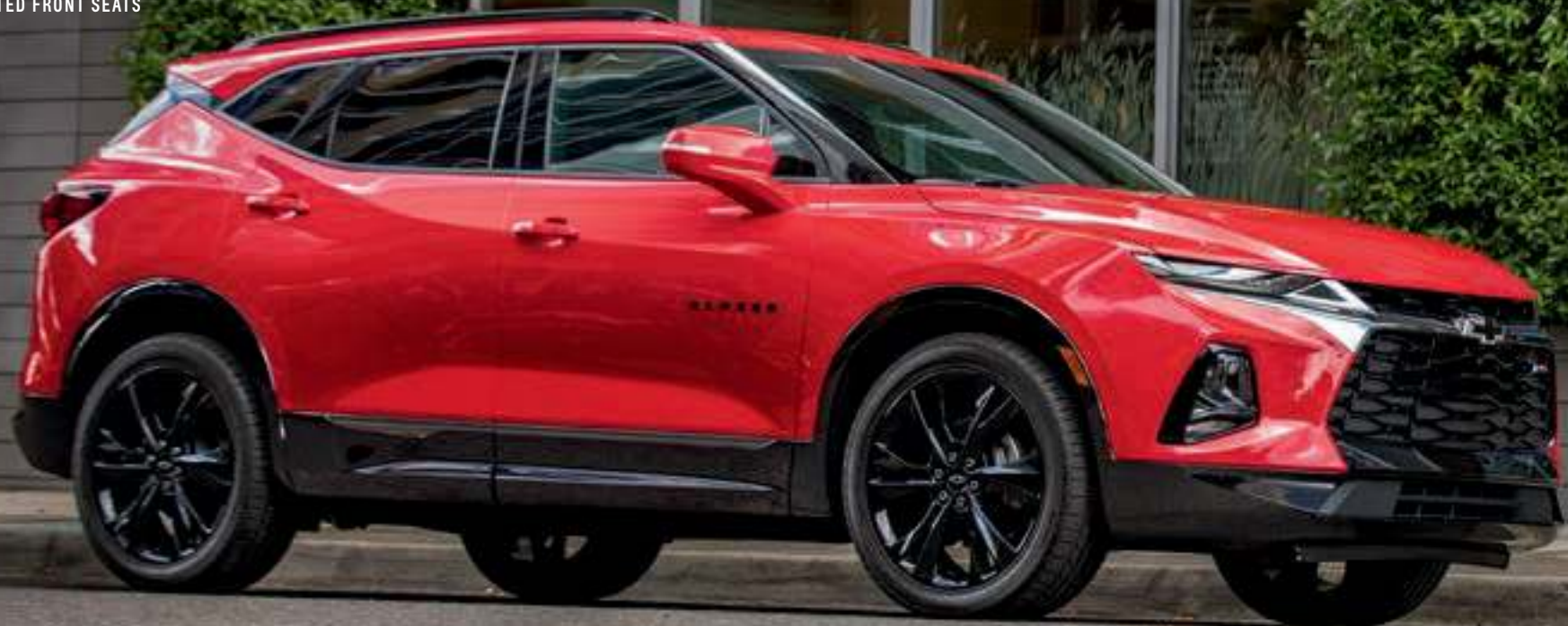
Blazer RS in Red Hot with available features including 21-inch wheels.