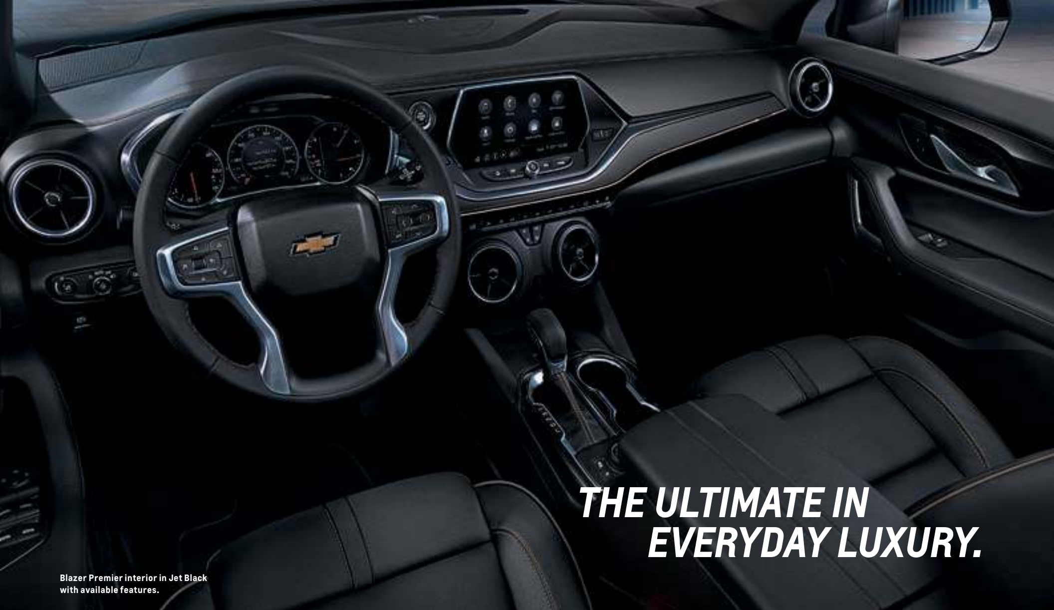
Blazer Premier interior in Jet Black with available features.