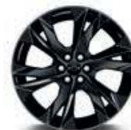
21" Gloss Black-Painted Aluminum Wheels Available on RS with Sun and Wheels Package