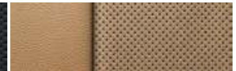
Jet Black/Maple Sugar Perforated Leather-Appointed Seating Surfaces with Sueded Microfiber Inserts (shown)

PREMIER In addition to or replacing RS features, this trim includes: