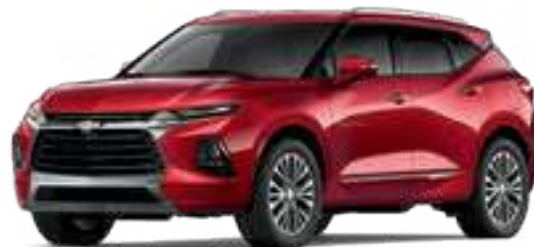
CAJUN RED TINTCOAT 3,6