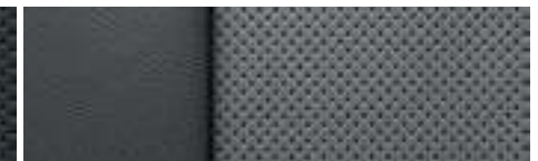
Dark Galvanized/Light Galvanized Perforated Leather-Appointed Seating Surfaces (shown)