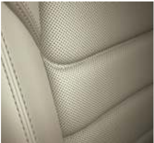
Parchment Leather Grand Touring and Grand Touring Reserve