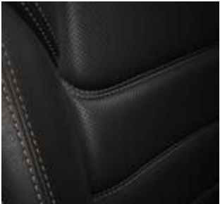
Black Leather Grand Touring and Grand Touring Reserve

Upholstery plays a unique role in automotive design. It is the one element that makes direct contact with the driver and passengers throughout the entire drive. Every inch of our carefully constructed upholstery elevates your journey in both beauty and comfort. Expert fabricators experiment with textures, stitching and seam placements to create a range of distinct and expressive designs. So you can enjoy an elegant level of refinement in every Mazda CX-5. It's one more way we consider you in every aspect of your drive.