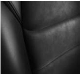
Black Leatherette/Lux Suede® inserts Touring