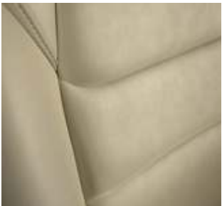
Silk Beige Leatherette/Lux Suede® inserts Touring