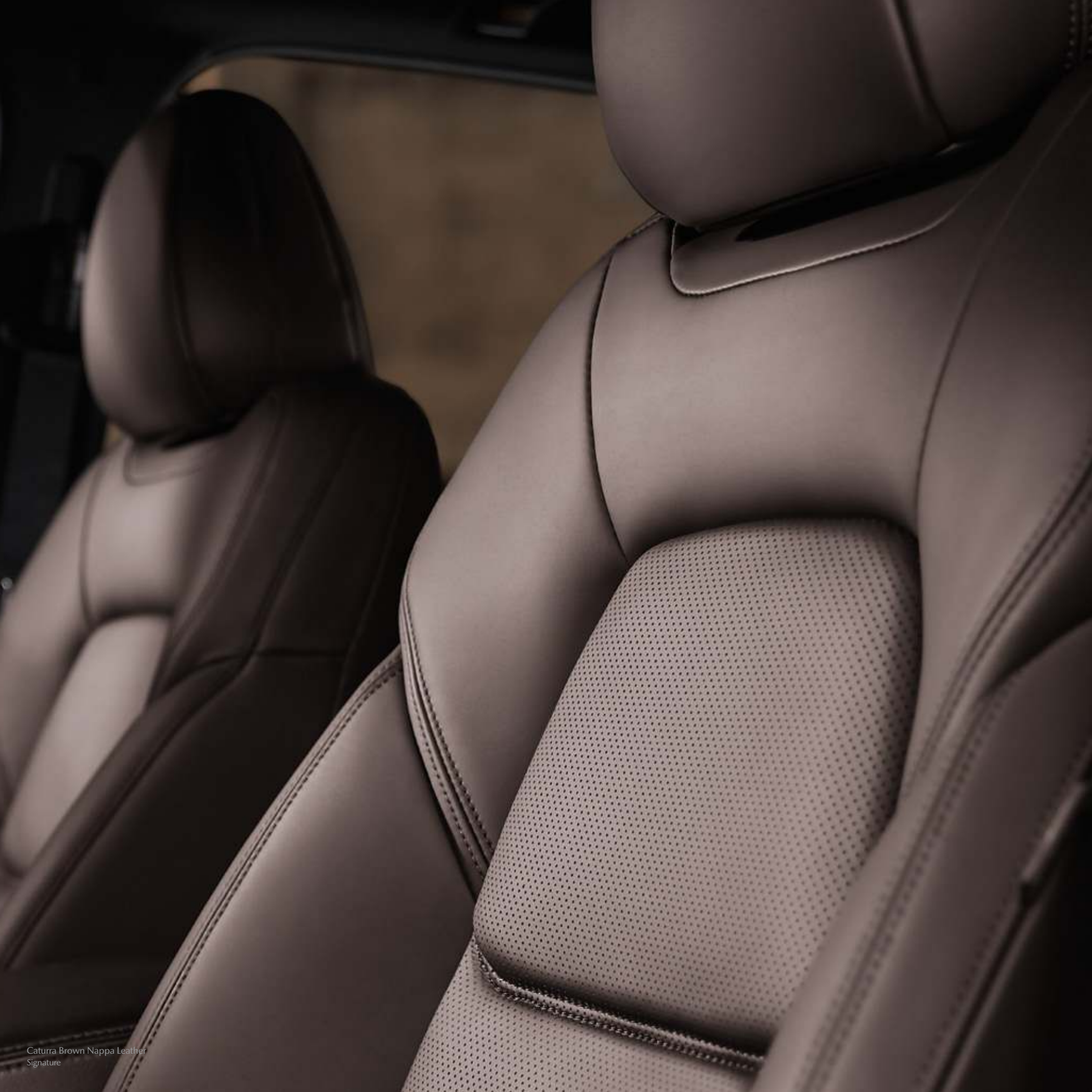
Caturra Brown Nappa Leather Signature