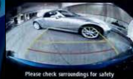
Blind Spot Monitoring System*