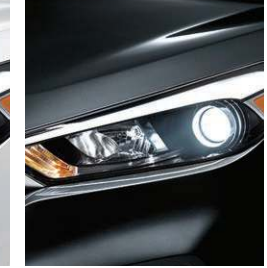
Black Noir Pearl