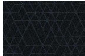
SE / Eco / Sport