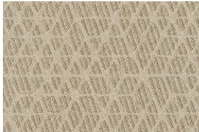
SE / Eco / Sport