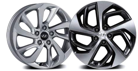
17" Alloy Wheel SE / Eco