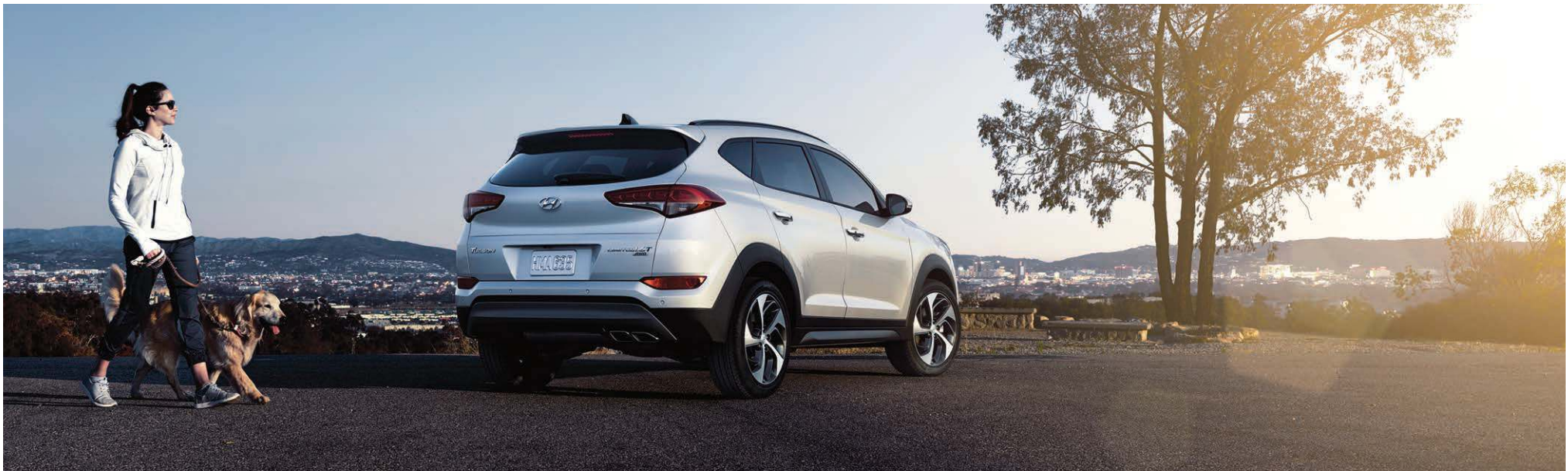
19" Alloy Wheel Sport / Limited