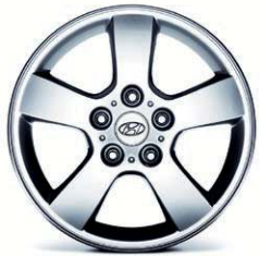
16-INCH GLS ALLOY WHEEL