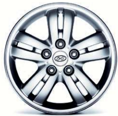
16-INCH SE/LIMITED ALLOY WHEEL