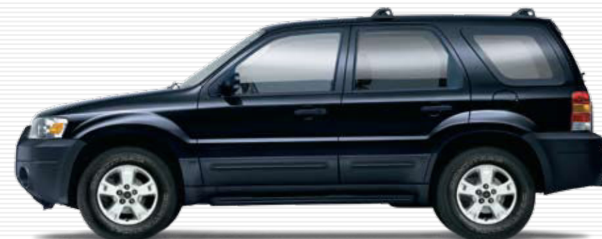
Escape XLT 4WD _ Black available side step bars