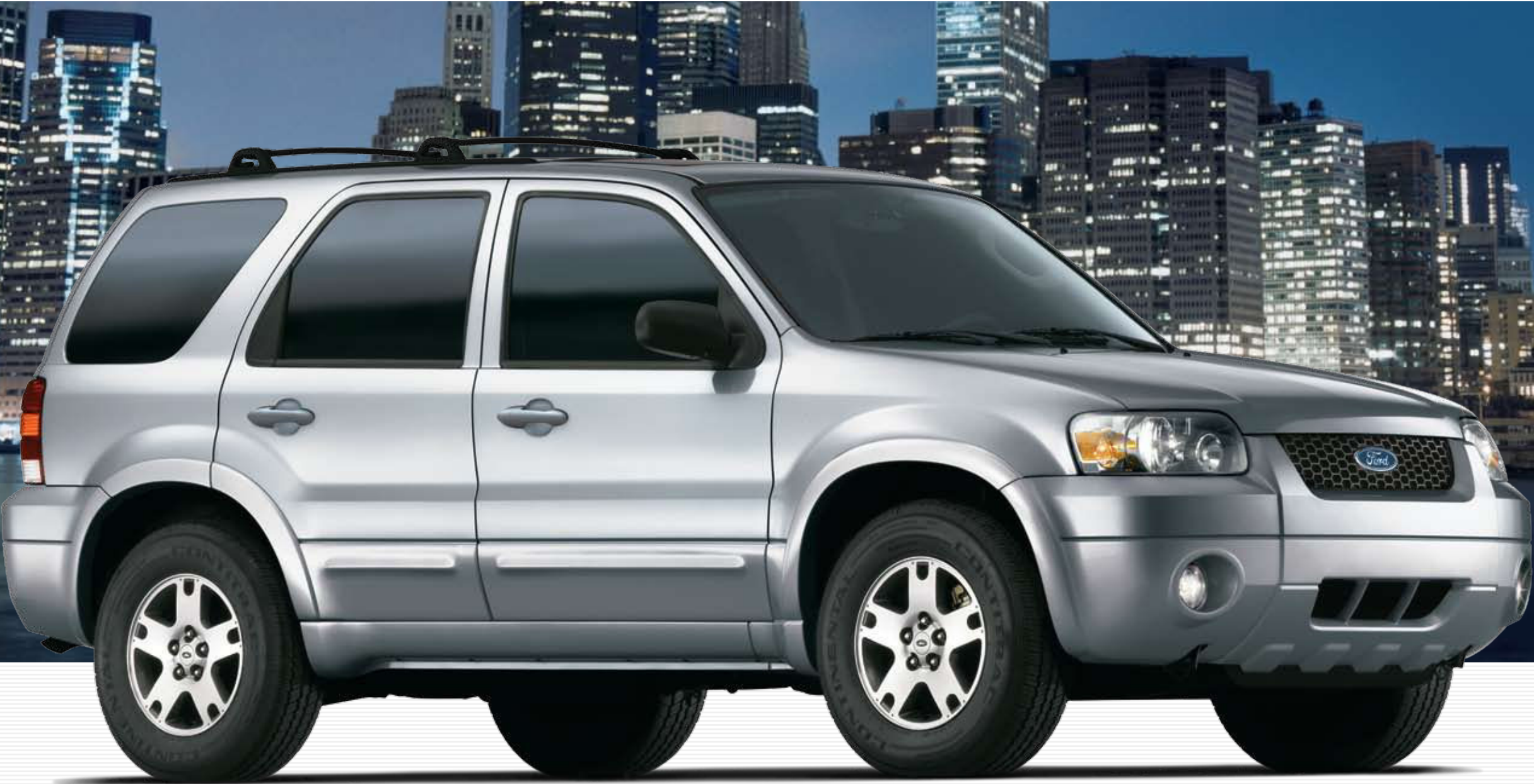
Escape Limited _ Silver Metallic available power moonroof