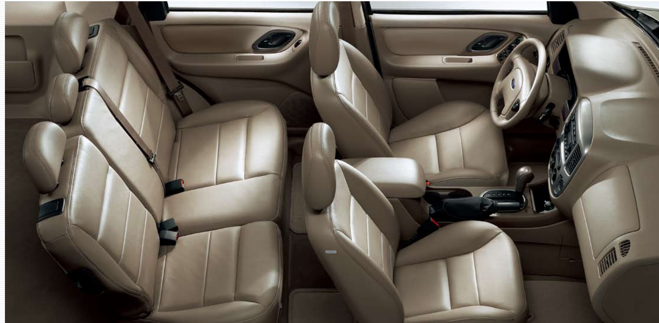
Escape XLT _ Medium/Dark Pebble Interior available Leather Comfort Group and Safety Package