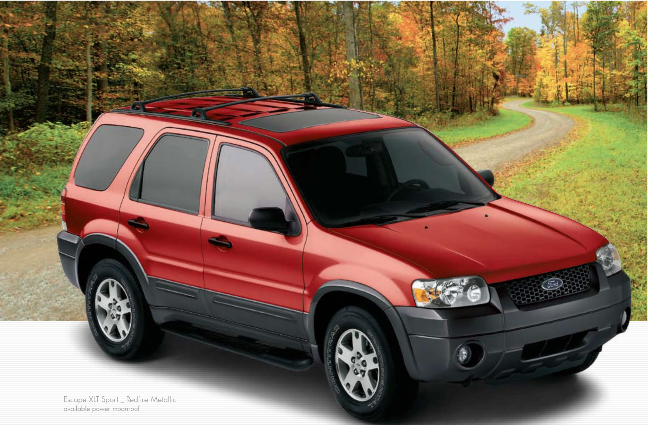
Escape XLT Sport — Redfire Metallic available power moonroof

Escape's refined Duratec 30-3.0L V6 engine features a new processor that's over 5 times faster than previous designs, greatly improving its overall performance. Escape's new Duratec 23-2.3L I-4 engine, standard on XLS and XLT, is smartly designed to deliver a quieter, smoother, more powerful ride and higher towing capacity than ever before. Factor in Escape's remarkably responsive power rack-and-pinion steering and 4-wheel independent suspension, and you'll be having more fun than you can imagine.