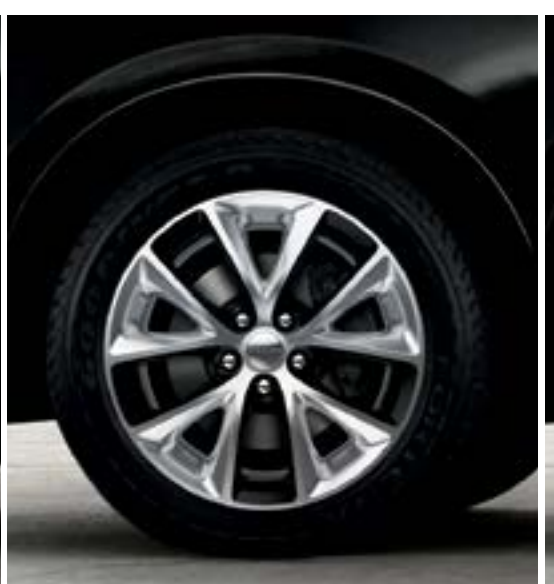
20-inch polished aluminum with Gloss Black pockets (optional on R/T)