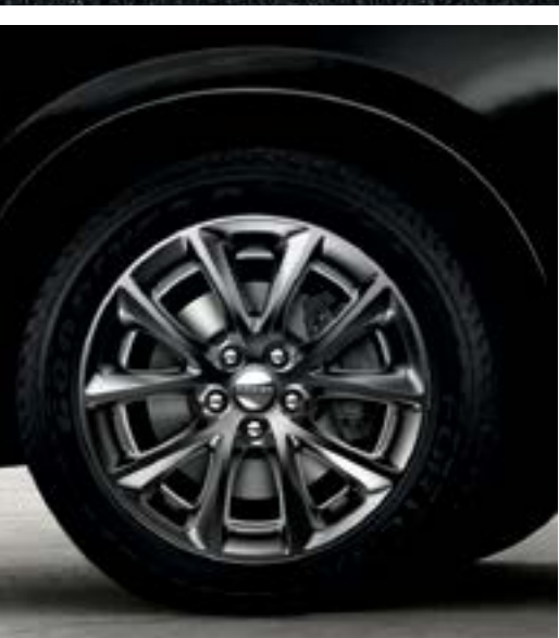
20-inch Hyper Black aluminum (standard on Rallye and R/T)