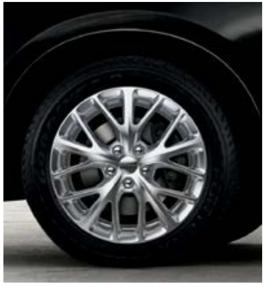
20-inch polished aluminum (standard on Citadel)