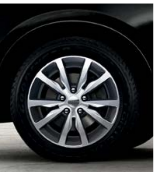
18-inch polished aluminum with Mineral Gray pockets (standard on Limited)