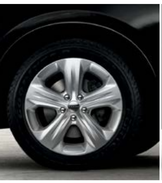
20-inch Satin Silver aluminum (optional on SXT; late availability)