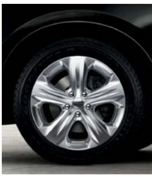
20-inch polished aluminum (optional on Limited)