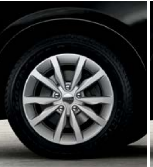
18-inch Tech Silver aluminum (standard on SXT)