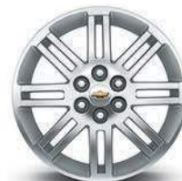
20" Machined-Aluminum with Painted Spokes (Available on 1LT; requires Style and Technology Package)