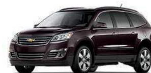
SABLE METALLIC 1,2