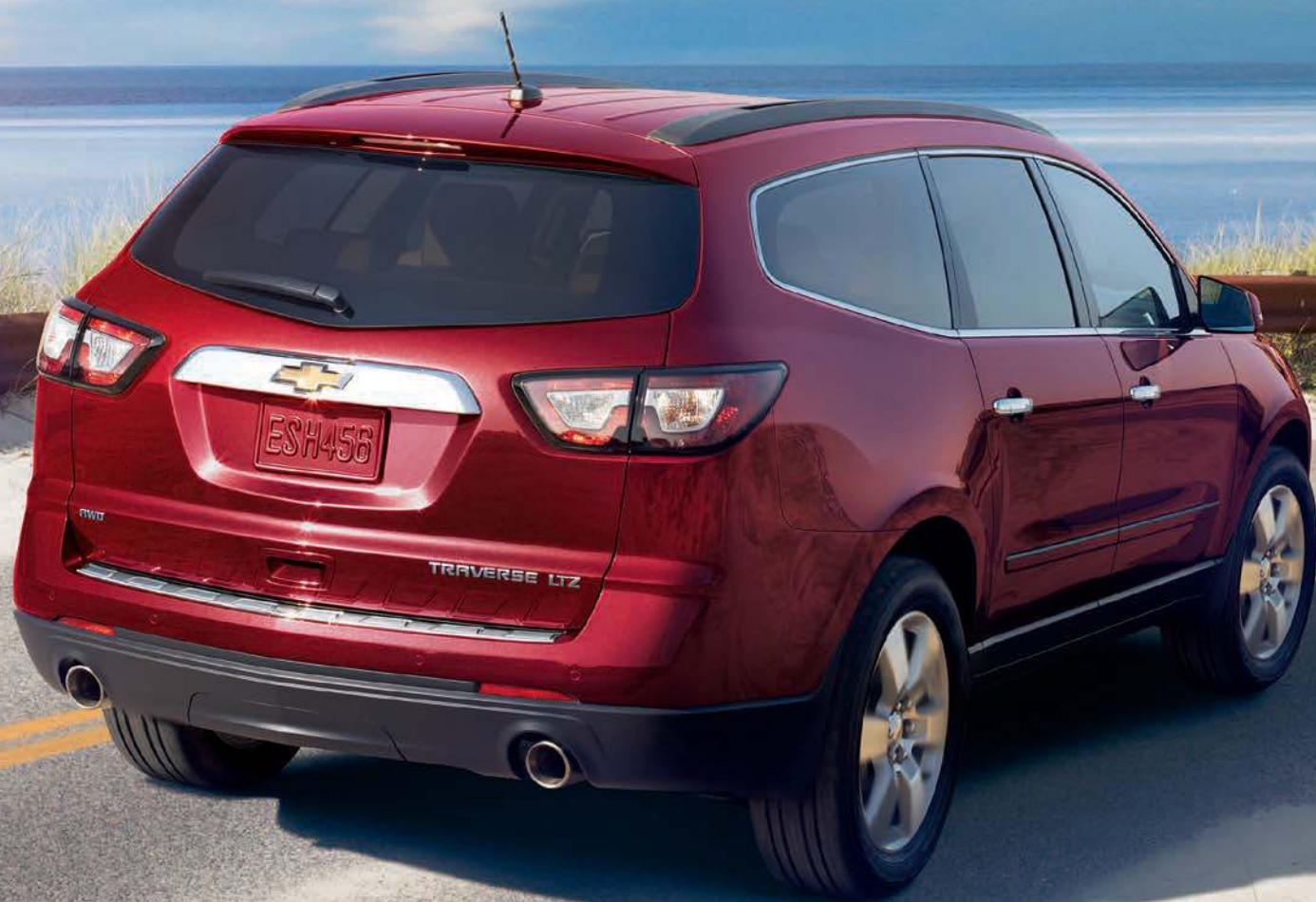
Traverse LTZ AWD in Siren Red Tintcoat (extra-cost color) with available features.