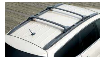
Roof Rack Side and Cross Rail Package