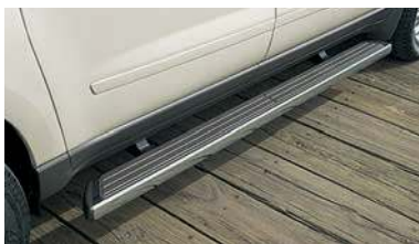
6" Chrome Oval Assist Steps

PERSONALIZE YOUR TRAVERSE AT CHEVROLET.COM/ACCESSORIES