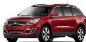
SIREN RED TINTCOAT 1,2