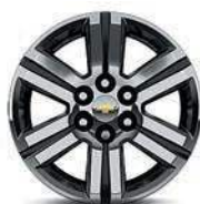
18" Machined-Aluminum (Standard on 1LT and 2LT)