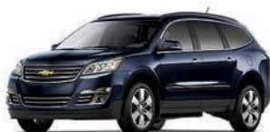
BLUE VELVET METALLIC