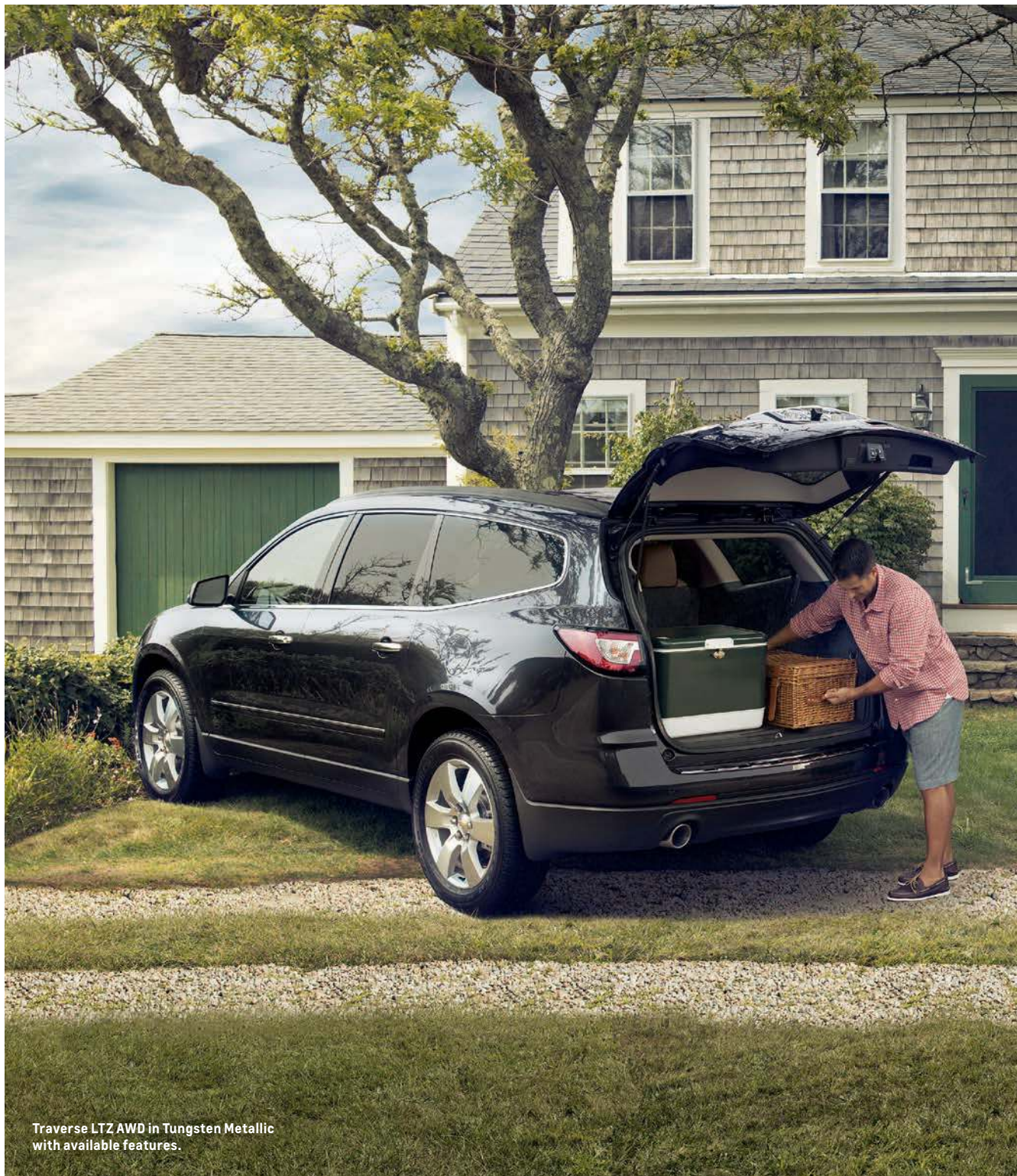
Traverse LTZ AWD in Tungsten Metallic with available features.