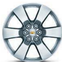
20" Aluminum (Standard on LTZ)