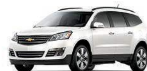
WHITE DIAMOND TRICOAT 1,2