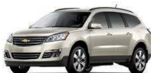
CHAMPAGNE SILVER METALLIC 2