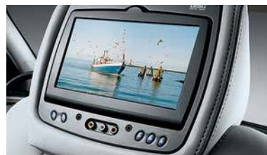
Dual DVD Rear-Seat Entertainment System