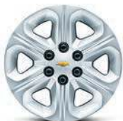
17" Steel with Painted Wheel Cover (Standard on LS)