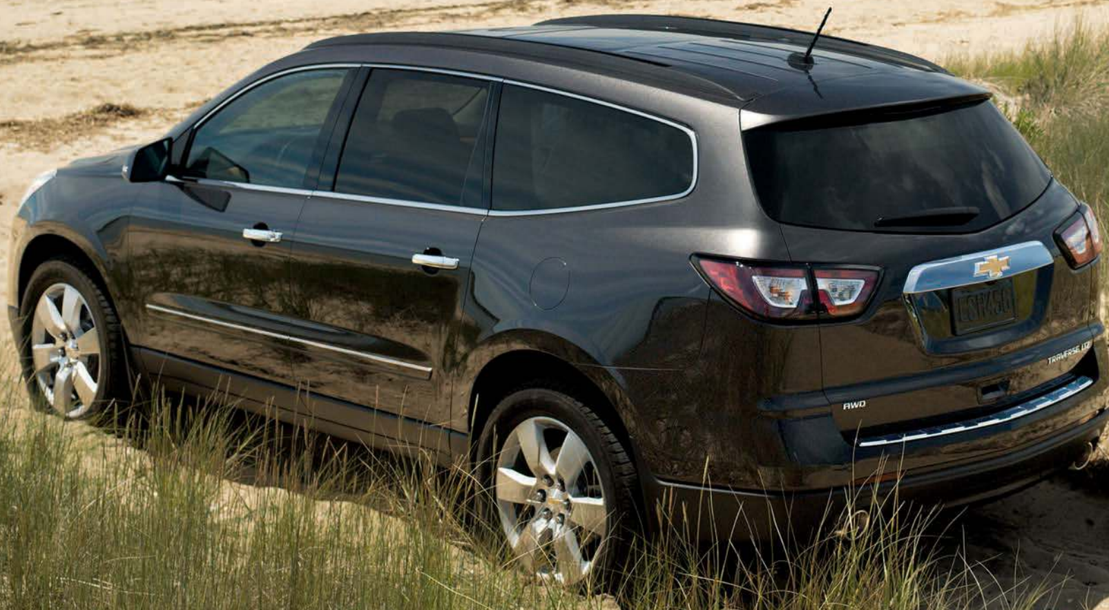
Traverse LTZ AWD in Tungsten Metallic with available features.