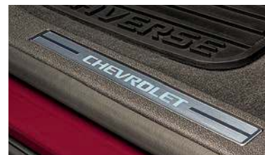
Front Door Illuminated Sill Plates