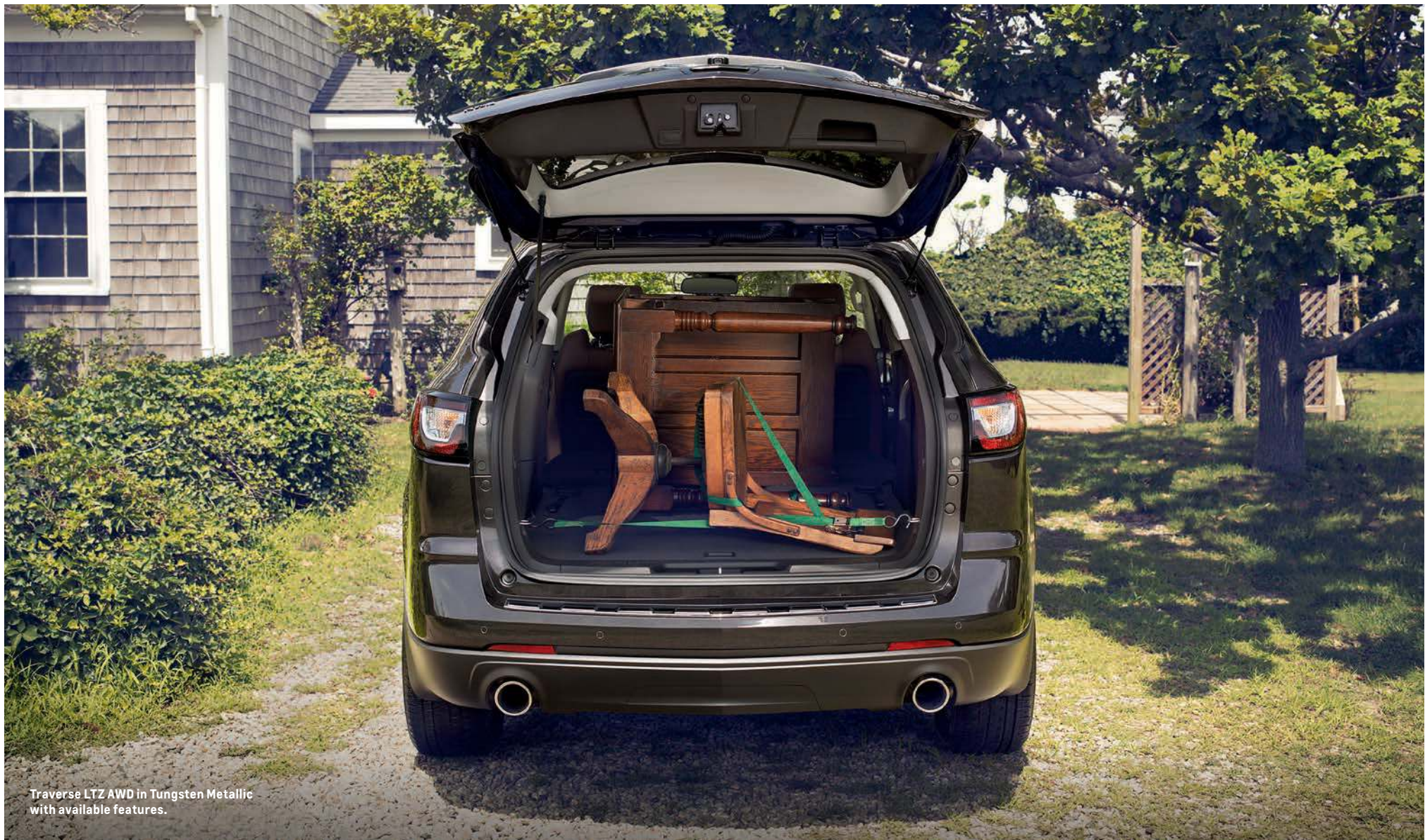
Traverse LTZ AWD in Tungsten Metallic with available features.

With a simple push of a button, the power-remote liftgate makes loading and unloading smooth and easy.