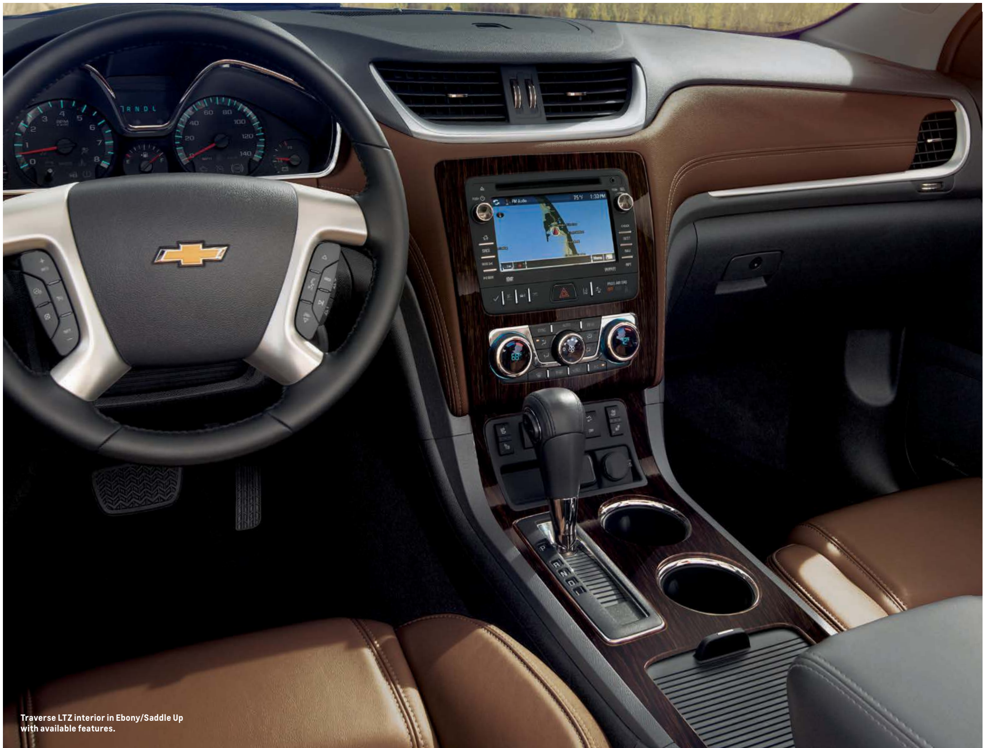
Traverse LTZ interior in Ebony/Saddle Up with available features.