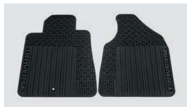
All-Weather Floor Mats