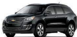
BLACK GRANITE METALLIC 1,2