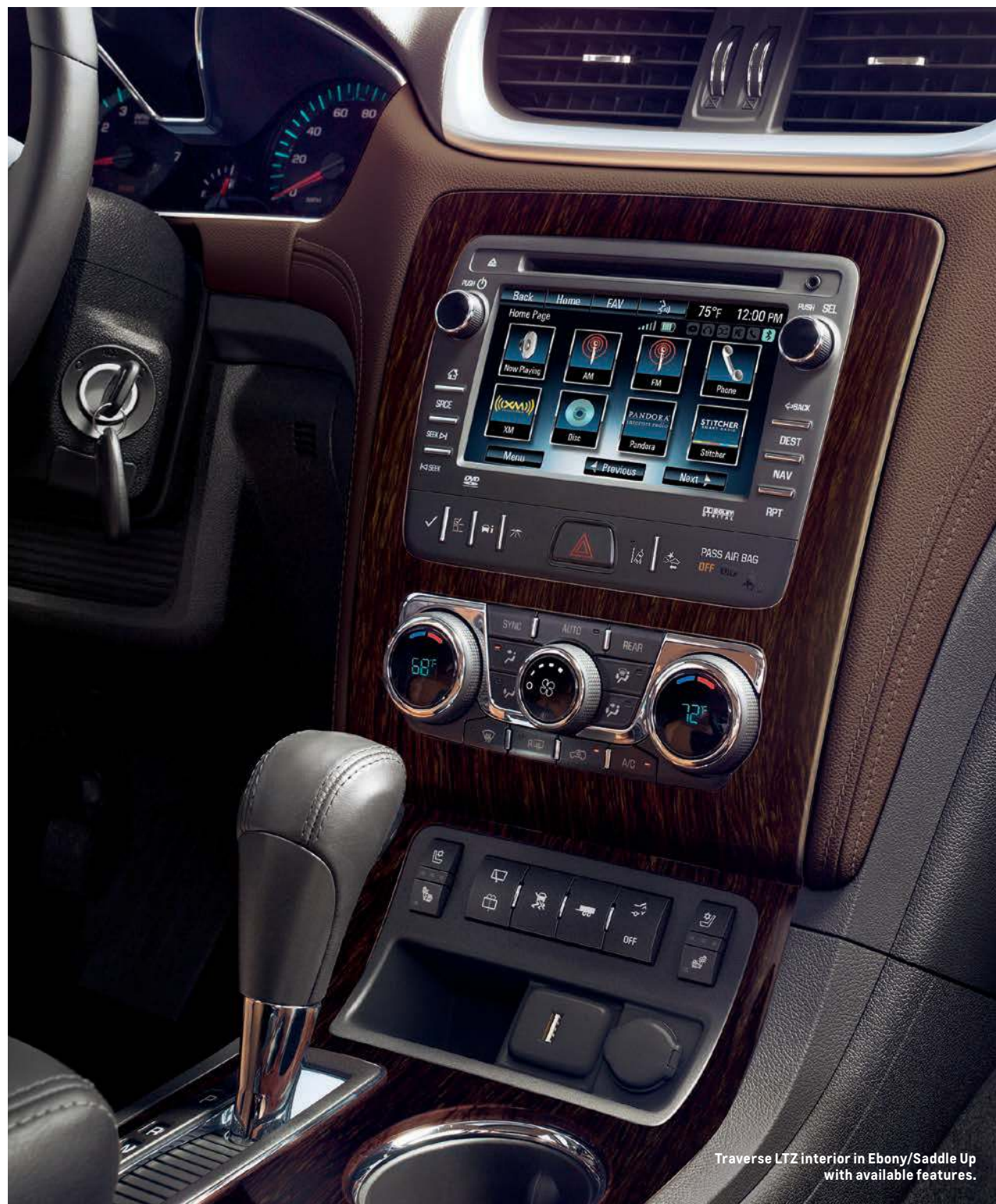
Traverse LTZ interior in Ebony/Saddle Up with available features.